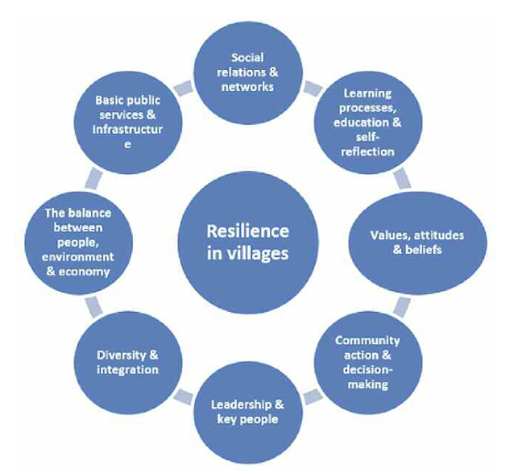
Source: Devised by the authors based on the analysis of the documents in Table 1 and on the subsequent integration of the disciplinary approaches from social ecology and psychology.