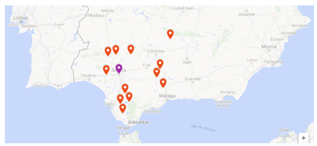
Fig. 3: Location of villages belonging to the southern norm

In Figure 2, villages are surrounding Madrid, the capital city of Spain. The nearest village is only 29 kilometers away from it, and the farthest one is 268 kilometers away. One could argue that villages up north next to Soria are too far away from Madrid. However, it has usually been assumed that that area still follows the northern norm, due to historic reasons (Penny, 2002).