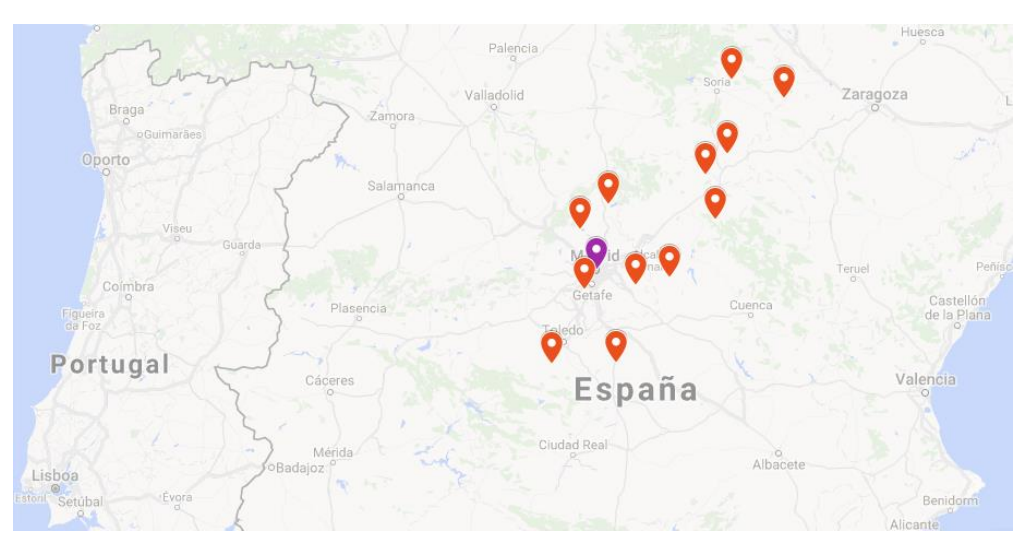
Fig. 2: Location of villages belonging to the northern norm

The precise location of each village can be seen in Figure 2 and Figure 3 below. Purple dots represent the 'normative city' and red dots represent each of the villages selected for the study.