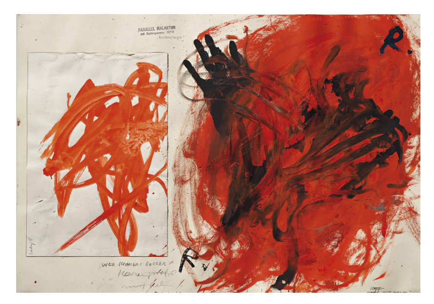
Arnulf Rainer, Parallel Malaktion mit Schimpansen (Parallel Action Painting with Chimpanzees), 1979, oil, graphite, paper collage, watercolour and ink on paper, 62.5 x 89.5 cm, © Arnulf Rainer https://www.christies.com/lotfinder/ Lot/arnulf-rainer-b-1929-parallelmalaktion-mit-6033116-details.aspx

express the agency of the ape but also gives clues about his artistic aims and creative drive.