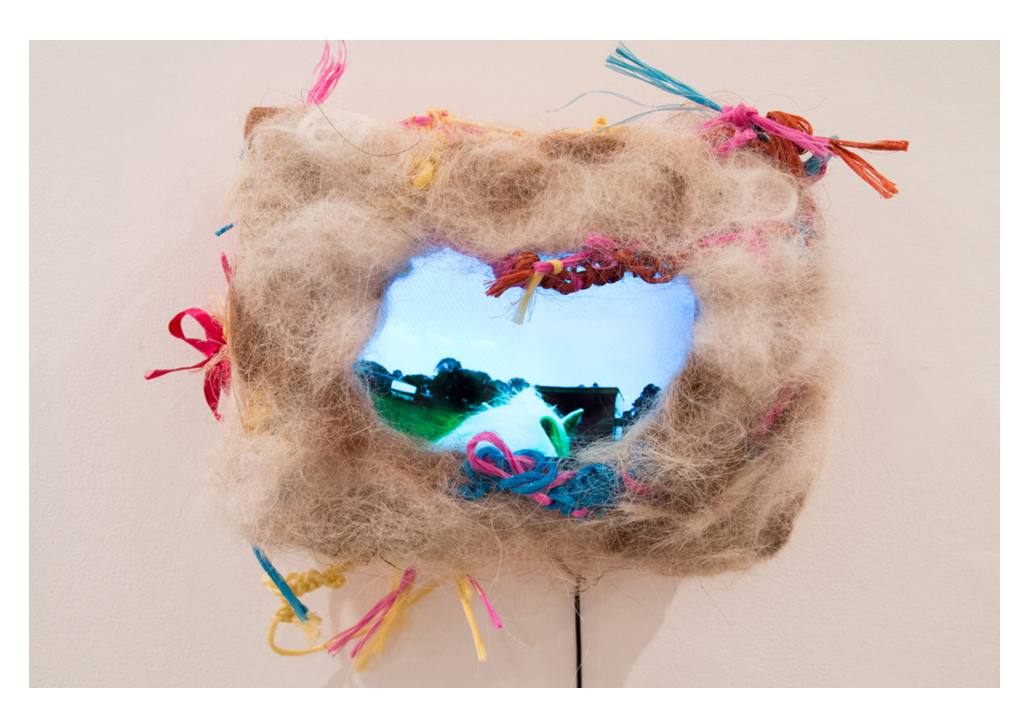
8. Madeleine Boyd with Prince the Pony, 27 minutes, 2016, Single channel digital video; 27 mins, digital tablet, horse hair and mixed media, © Madeleine Boyd

humans each have one half of a table and the birds are allowed to fly freely in the big loft. It is intended that the work in progress Studio destructiones gives space for joint as well as for separate human and avian creative productions. In this prepared environment, the two pairs can lead not only parallel, but intertwined lives. For their project CMUK (weekly) [9], for instance, Hörner/Antlfinger leave the newspaper ZEIT's weekly magazine to their animal companions for a reworking. The interventions of the birds include scratching and biting, they make tears and holes in the paper and thus create interesting vistas and see-throughs in the shredded journal which open up surprising insights in the relations of text and images on the various pages. The birds are certainly not aware of the formal and cognitive attraction or the art-historical reference point of the decollage. Nevertheless, the handing over of the newspapers is a ritual likely valued by the birds, and their gnawing, nibbling and scraping constitutes an enjoyable activity. It might not have any biological function but just be a playful, purposeless and self-rewarding occupation - and some people might define art as well as playful, purposeless and self-rewarding. The parrots decide if and when they want to work with the journal and how they want