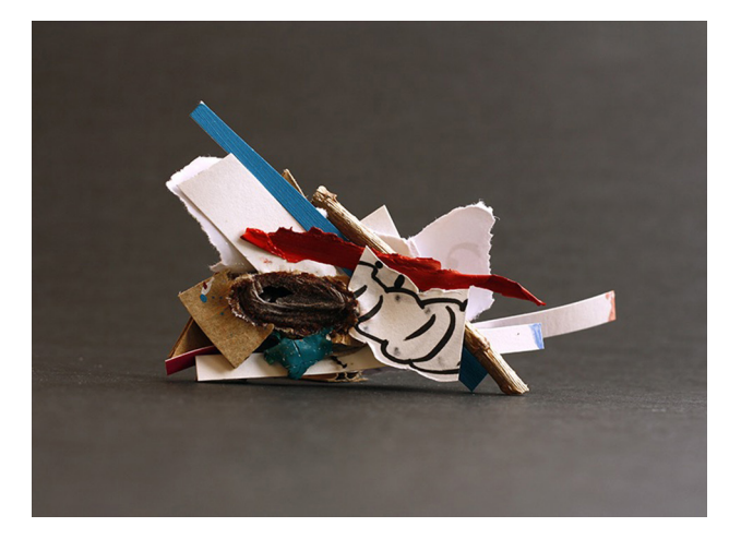
6. Joos van de Plaas: Sleeping Beauty, 2013, no. 10, 10,8 cm x 7,5 cm x 2,3 cm cocoon, cardboard, acrylic, paper, branch, © Joos van de Plaas

A similar process as in van de Plaas' collaborations with butterflies is initiated by Björn Braun for a series of sculptural