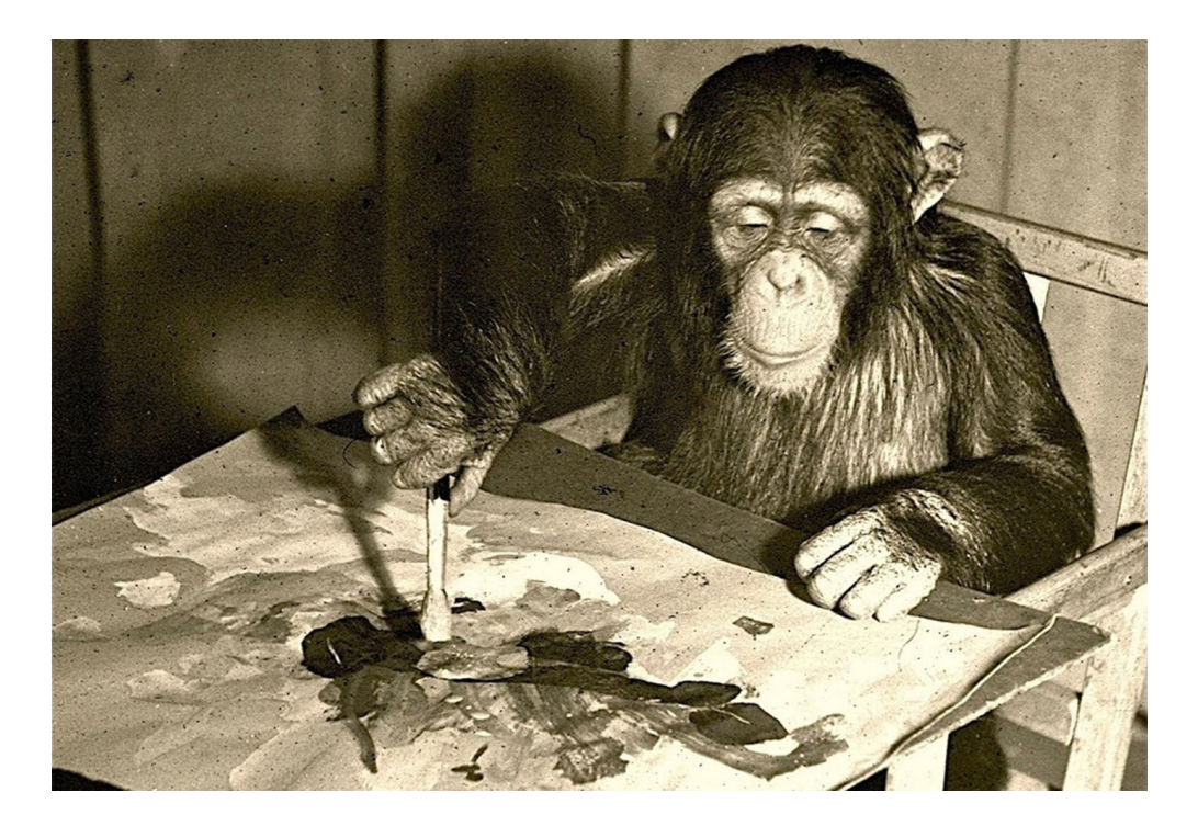
3. Congo painting at London Zoo, 1957, https://archive.ica.art/bulletin/last-living-surrealist-desmond-morris-paintings-chimpanzees-his-work-and-origins-ica

work-like contexts: together they form a joint actor (Latour, 2005). And finally, as part of the emergence of New Materialism, theorists have developed a similarly open concept of distributive agency or non-intentional agency in so-called intra-action (Barad, 2007).