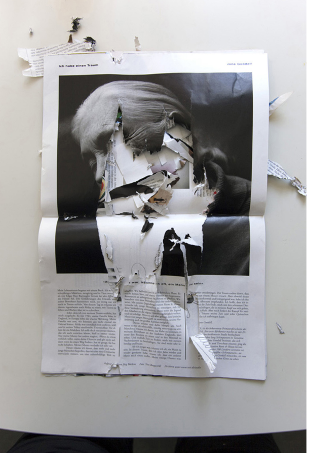
9. CMUK, Weekly, since 2014, décollage/photo, 40 x 60 cm