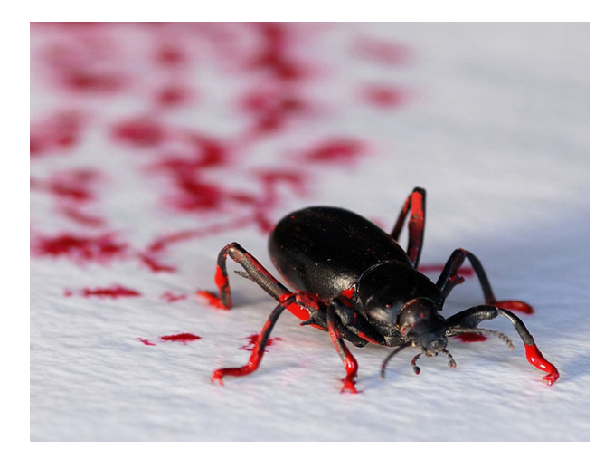
1. Steven Kutcher, Darkling Beetle making footprints, © Steven Kutcher, http://bugartbysteven.com/?page_id=658

a brush or other painting material. This popular anecdote illustrates the genius of a human master not the artistry of his animal tool.