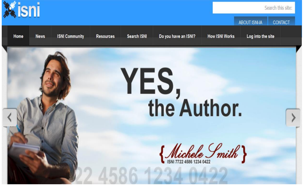
Screen shot for Michele Smith, the author (ISNI, 2018)

The same problem occurs in our library catalogues. Establishing the correct entity can be a time-consuming and detailed process. Once the correct identity is found, we want to be able to find other materials related to this person. Traditionally, libraries have used a unique form of the person's name to collocate materials by that person. ISNI takes a different approach, assigning instead a unique number to identify a person. This number can be used in linked data as a bridge identifier to connect this person to other resources by and about the same person, without the need to regularize the form of the name (ISNI website 2018, homepage).