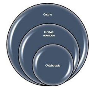
Figure 1.2. Conceptual model for the development and validation of a silhouette scale to measure a mothers' perception of body size of their two to four year old children (generated from 'The Purnell Model for Cultural Competence', 2014).

With obesity, a global crisis associated with widespread morbidity and mortality in adults, and more recently identified in children, it is the Purnell Model for Cultural Competence (2000, 2002) that may influence interventions to reverse this trend and guide NPs in their practice (Abrams & Levitt Katz, 2011). Disparities in health and healthcare exist across ethnic, social, and economic groups. NPs and other health care providers need to understand and respect cultural diversity in order to achieve a high level of cultural competency. A cultural perspective and understanding of those at high risk for disease processes that present later in life require practitioners to follow a model that provides a framework that includes questions asked of all ethnic groups and that formulates the appropriate individual plan of care (Gower, Nagy, Trowbridge, Duesenberg, Goran, 1998) (see Figure 1.2).