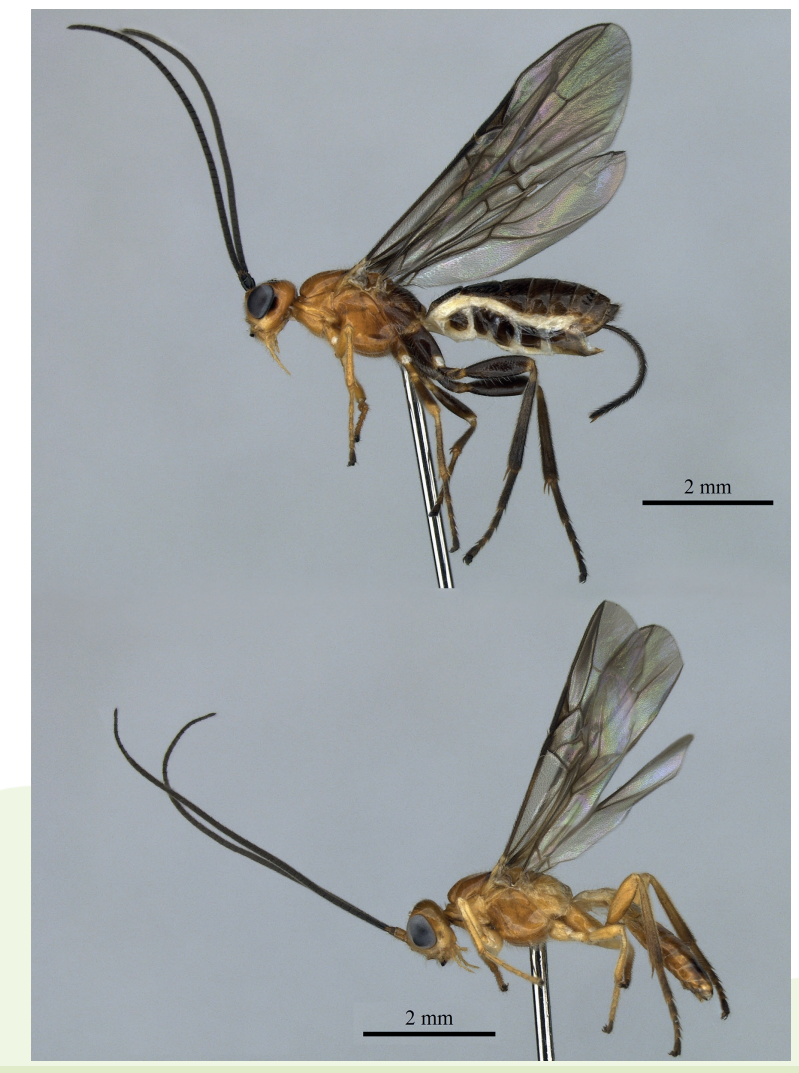
Figure 2. Bracon zuleideae Perioto & Lara, 2011 (Hymenoptera, Braconidae), habitus lateral of female and male.

In this study, the geographical distribution of B. zuleideae is extended by about 900 km north from the type locality and the species is now mentioned for the Minas Gerais State (Figure 3). P. ovatum is a plant widely distributed over vast areas of the Cerrado and Amazon biomes (REFLORA 2019) and this fact allows us to infer that the geographical distribution of B. zuleideae can be much wider than currently known.