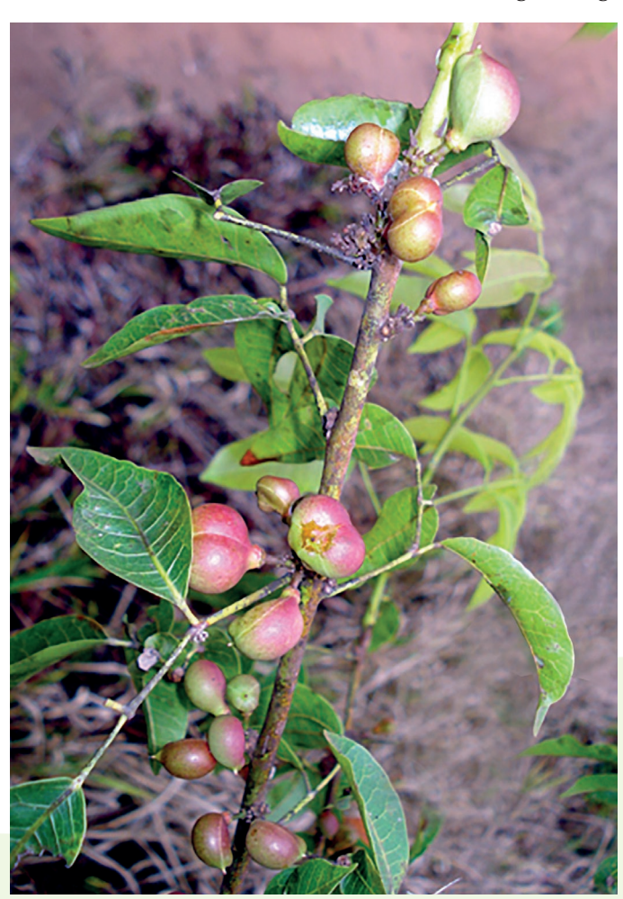
Figure 1. Branch with fruits of Protium ovatum Engl. (Burseraceae).

Images were taken using a digital camera Leica MC170 HD attached to a stereomicroscope Leica M205C APO and specimens illuminated with high diffuse dome illumination Leica LED5000 HDI. Focus stacking of images was done using Helicon Focus