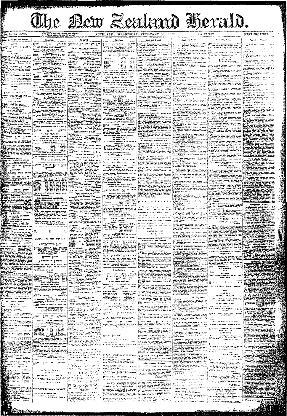
Figure 2: New Zealand Herald, 12th February 1913, front page