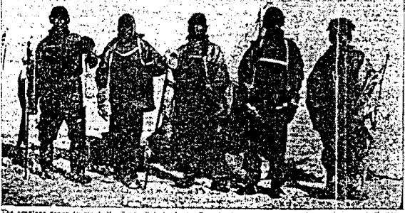
The press group to reach the South Pole by land—Captain Scott and his party at the Pole 45 years ago. Left to right are Dr E. A. Wilson, Captain R. F. Scott, Party Officer E. Evans, Captain L. E. G. Oates and Lieutenant H. R. Bowen. This picture was taken on January 18, 1912.