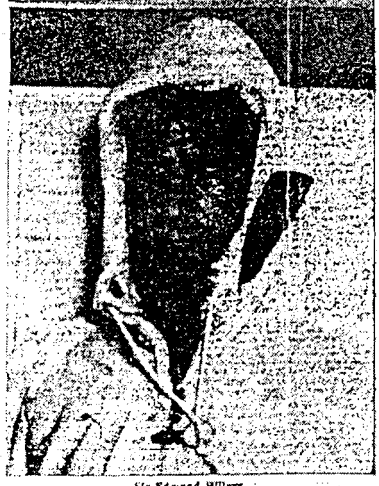
Sir Edmund Hillary

An N.Z.P.A. (Travellers) message from London says it is believed the British party has completed the most part of the journey and there is now a reasonable prospect of speedy progress to the Pole.