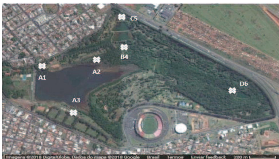
FIGURE 1: Study area – sampling points (X): Pond A (A1, A2, A3), Pond B (B4), Pond C (C5), Pond D (D6) – (Source: Google Earth 2018).

Observations were made using binoculars (8 x 40 mm) in the morning (between 06h00 and 12h00), totaling a sample effort of 184 h. The number and height of potential perches were recorded considering the area of the pond and its surroundings, occurrence on the margin (up to 2 m from the point to the pond), and occurrence of agonistic interactions (intraspecific and with other piscivorous species), all within a fixed radius of 100 m. Perches (artificial or natural structures) were quantified and measured using the Smart Measure v.1.5.11 application (Smart Tools co.) available for mobile phones. The margin of each pond was measured using the My Tracks v.2.0.9 (Google Inc.) application, also available for mobile phones. Data about temperature and rainfall in Uberlândia were obtained from the