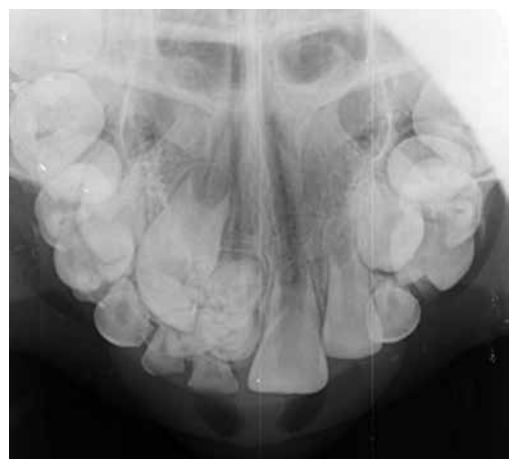
Figure 1: Preoperative occlusal radiography showing multiple radiopaque masses and impacted teeth.

the eruption of the impacted teeth to see if there will be a requirement for further orthodontic treatment.