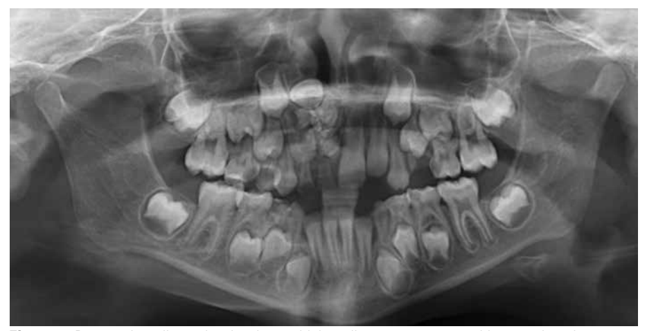
Figure 2: Panoramic radiography showing multiple radiopaque masses and impacted teeth.