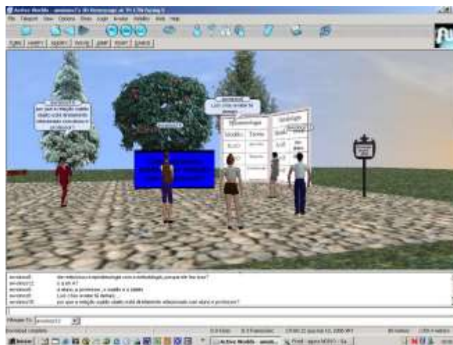
FIGURE 3 – Interaction in metaverse, through avatar

The interaction flow is kept during the graduation course of the educator in congruence with the DTs that compose the context of digital technological hybridism. Thus, in the metaverse, in which human beings are represented by avatars and use different languages to communicate, we can have a notion of the flow that feeds the tribe, because there is horizontality in the relationships, the sharing of what each one knows and they all together reflect about the kinds of knowledge in a creative, playful way. According to figure 3, this was captured during the graduation of educators, using the metaverse for interaction.