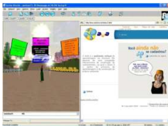
FIGURE 1 – Hybrid among metaverse, learning virtual environment and communicative agent

This way, we create and recreate a hybrid context, that is, the context of the digital technological hybridism, which interfaces can be the most varied regarding the figures that follow.