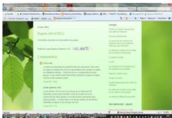
FIGURE 5 – Record on comments of blog

Those relationships actualize in a heterarchical acquaintanceship and of sharing of perceptions in virtual digital spaces. Thus, human beings establish proper 4 behavior for this social system, which become consensus in acquaintanceship until the moment they are no longer wanted or do not answer the needs of the community. It is then that, through disturbance, they define and redefine consensual behaviors in a in a dynamic way.