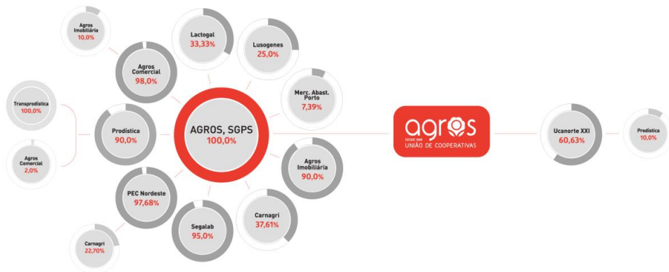
Figure. 3. Agros Group.

Agros Group - http://www.agros.pt/a-agros#grupo-agros