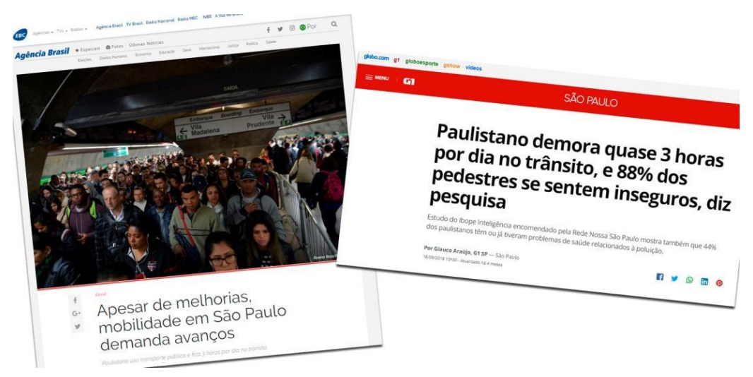
Figure 3 - Articles on mobility problems in São Paulo/SP.

urban problem in cities in the new millennium (Figure 3).