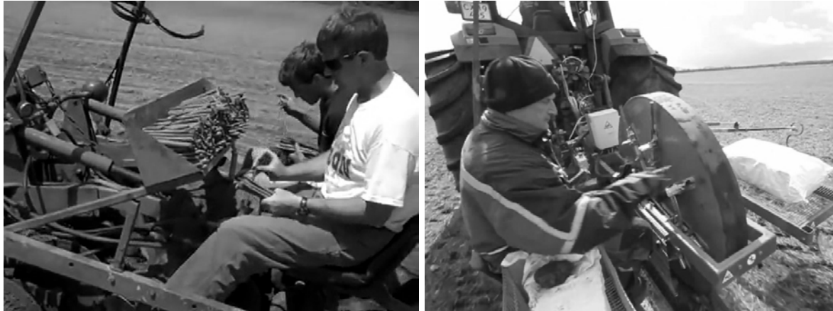
Graph 2: Traditional energy willow planting with manual feed cuttings.

To create a machine for planting such material the cutting should be transported fast and accurate. The study is an attempt to find strategies for justifying the cutting movement during their unloading from the accumulative capacity (YERMAKOV, 2017; YERMAKOV; BORYS, 2015; YERMAKOV; TULEJ; SHEVCHUK, 2018).