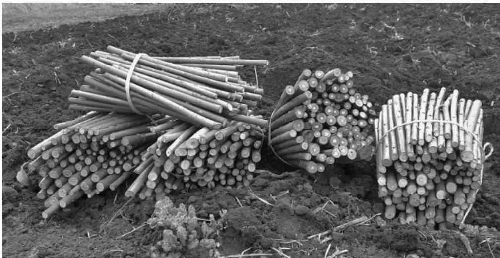
Graph 1: Energy willow planting material

An example of such a material is cutting. This issue is an up-to-date one due to increased popularity of fuel on the basis of bioenergy crops and, consequently, the need in fast and efficient machines to create so called energy plantations. One of the most common crops is energy osier. The osier is planted by vegetative way with the help of cutting 20-25 cm long and 8-20 mm in diameter (graph 1).