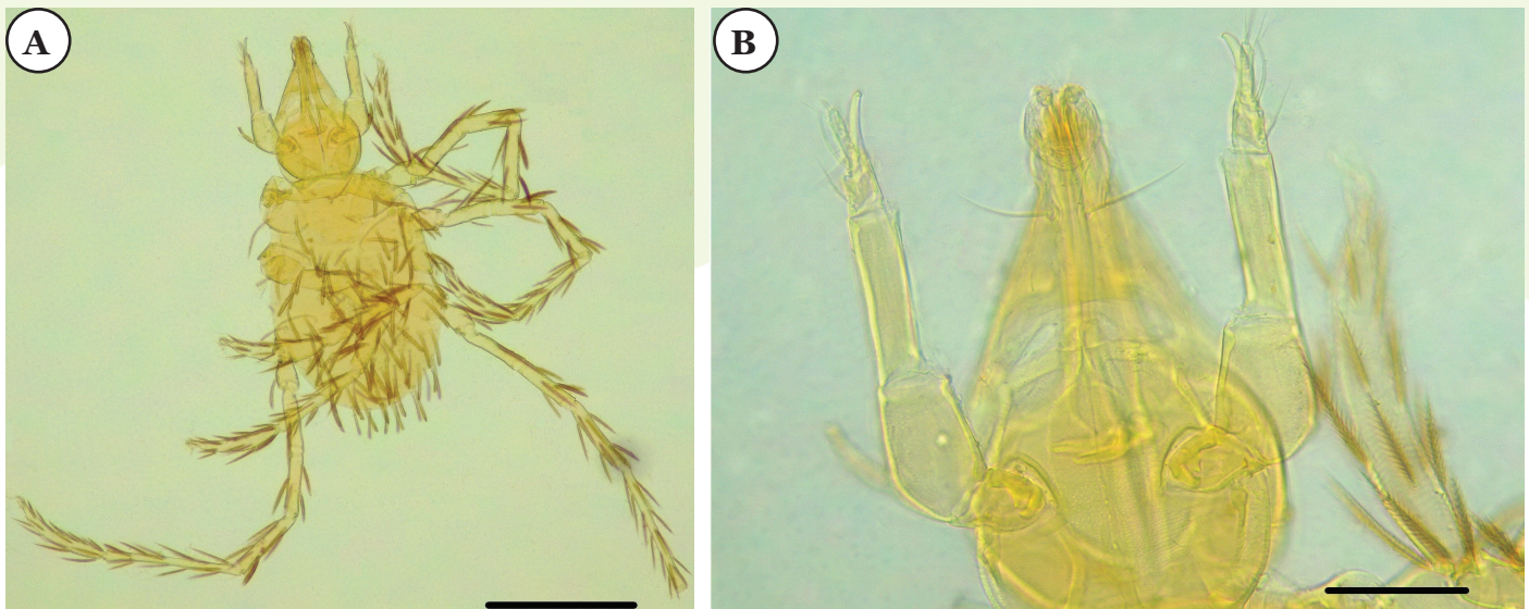
Figure 3. Leptus larva. (A) Photomicrograph of Leptus specimen: eyes 7-segmented legs, one circular eye on each side, on idiosoma posterolateral to dorsal scutum, dorsal scutum more or less triangular. Black sidebar measures 200 micrometers. (B) Photomicrograph of gnathosoma of Leptus specimen: Gnathosoma with the chelicerae bases narrowing anteriorly to a projecting beak, cheliceral digits tipped with small boring piece (terebellum) and gnathobasal setae (palpal coxal setae) absent. Black sidebar measures 50 micrometers. Pedro Henriques Silva's photos.

leaves the host and develop into nymph and free adult predator (SOUTHCOTT 1961).