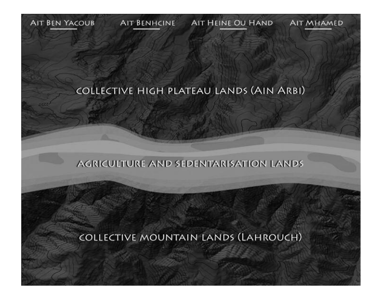
Figure 2. Land division among tribe fractions

There are a variety of collaborative strategies employed for this transhumance. There are at least three different options (Mahdi 2012): (a) the whole family can travel, or the family can split up, sending only some of its members; (b) the family may not move at all, entrusting its flock to a shepherd and (c) families can cooperate, with either one of them handling the other's flock, or two flocks being grouped together and entrusted to a paid shepherd.