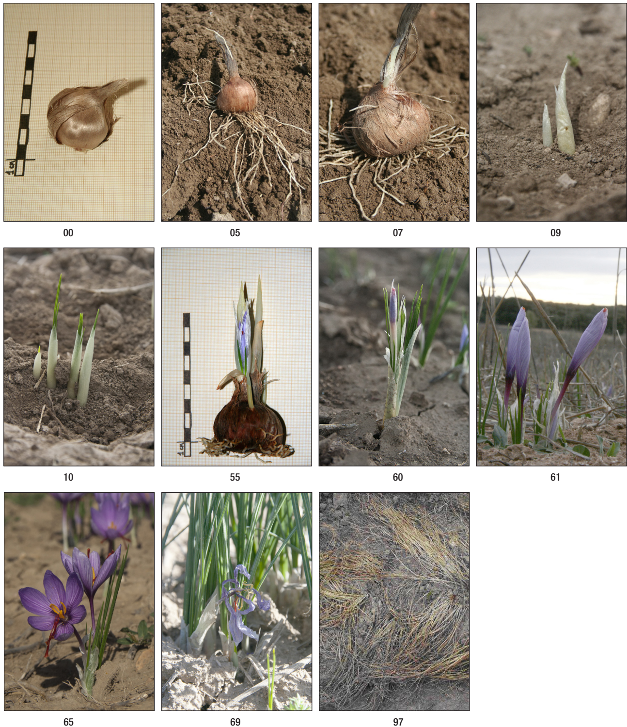
Figure 1. Selected principal and secondary phenological growth stages of annual cycle of saffron ( Crocus sativus L.) corresponding to sprouting (0: 00, 05, 07, 09), leaf development (1: 10), appearance of flower cataphylls (5: 55), flowering (6: 60, 61, 65, 69) and senescence (9: 97), according to the extended BBCH-scale.

the second fortnight of October on. The above-ground plant growth derived from sprouting is due to available reserves in the corm. Flowering occurs from the second fortnight of October to the first fortnight of November (ITAP, 2013), and previously to leaf appearance or