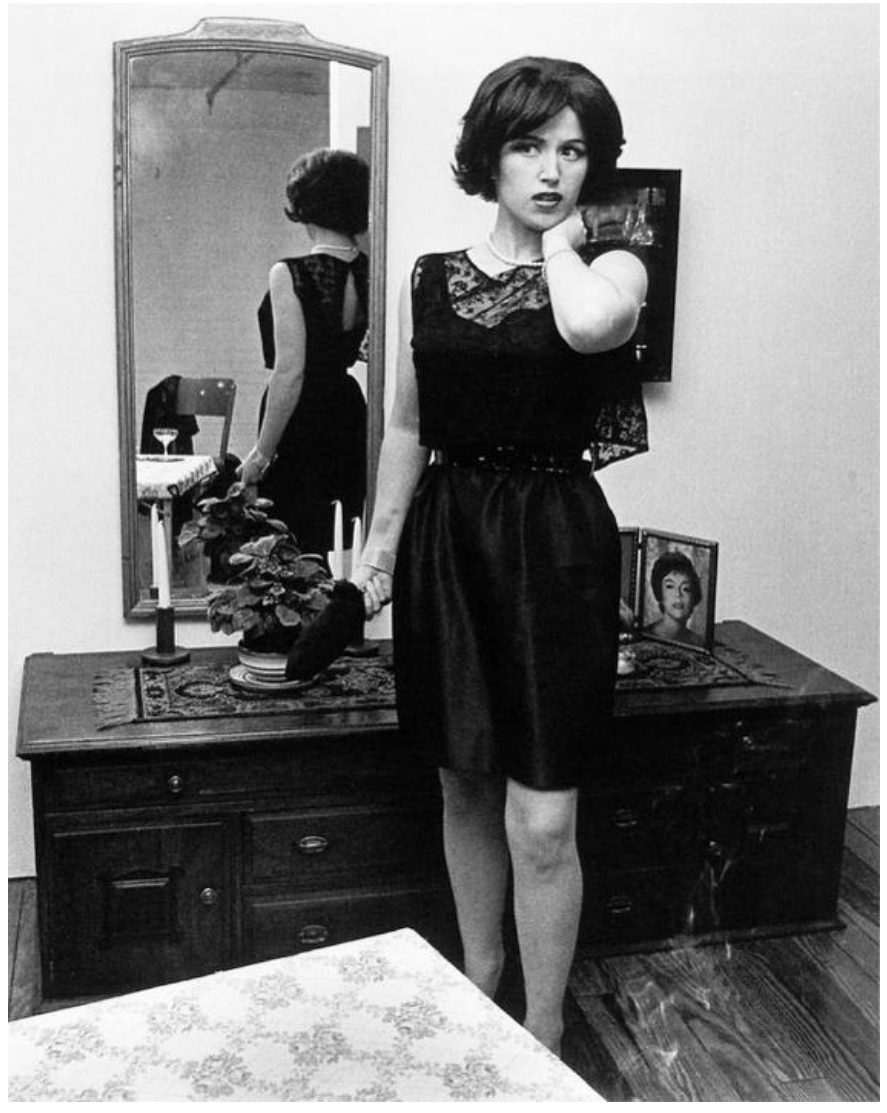
Image 4 . Cindy Sherman. 1978. Untitled Film Still #14 . Photography.