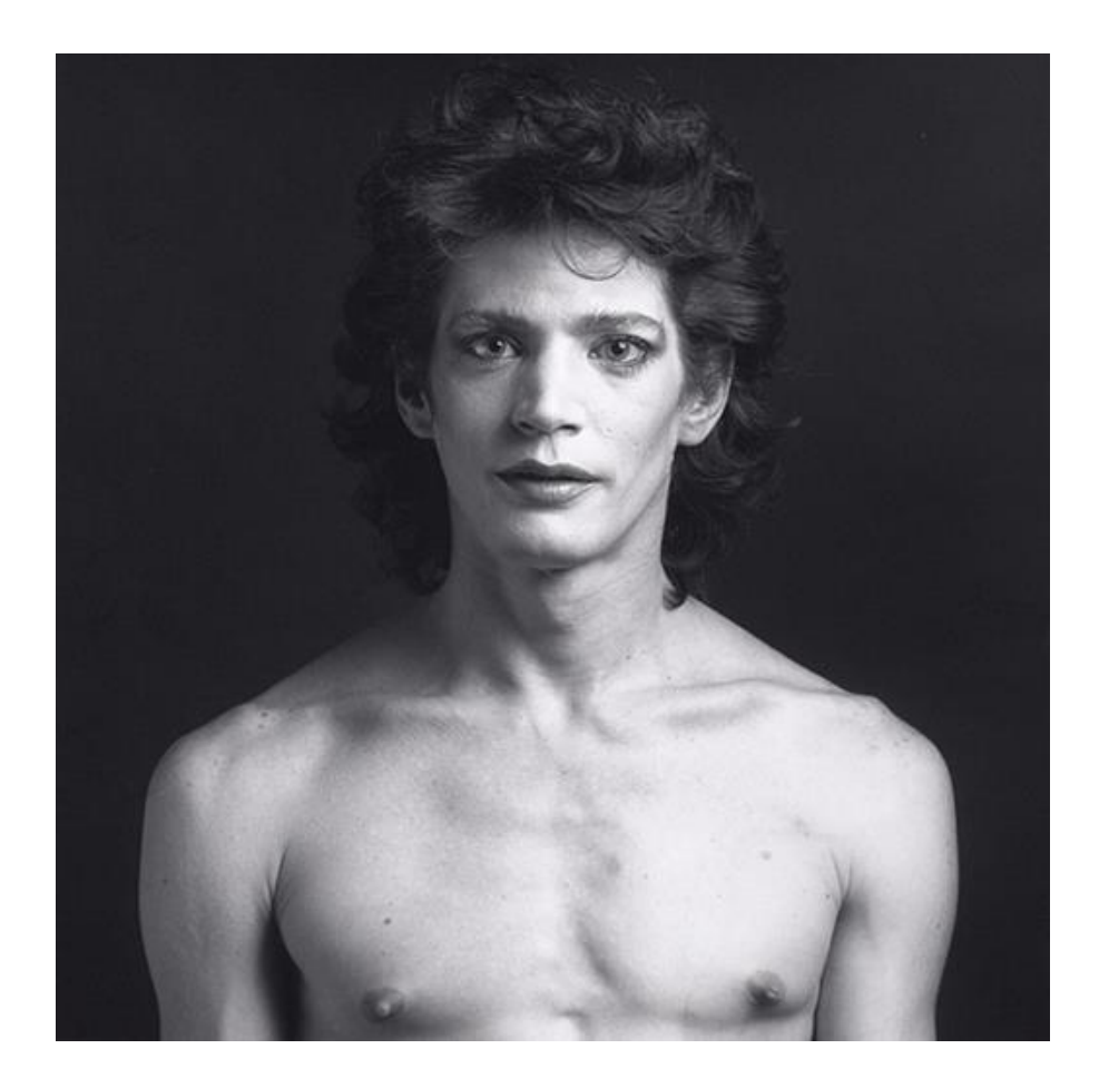
Image 3. Robert Mapplethorpe. 1980. Self-Portrait as Cross-dresser. Photography.