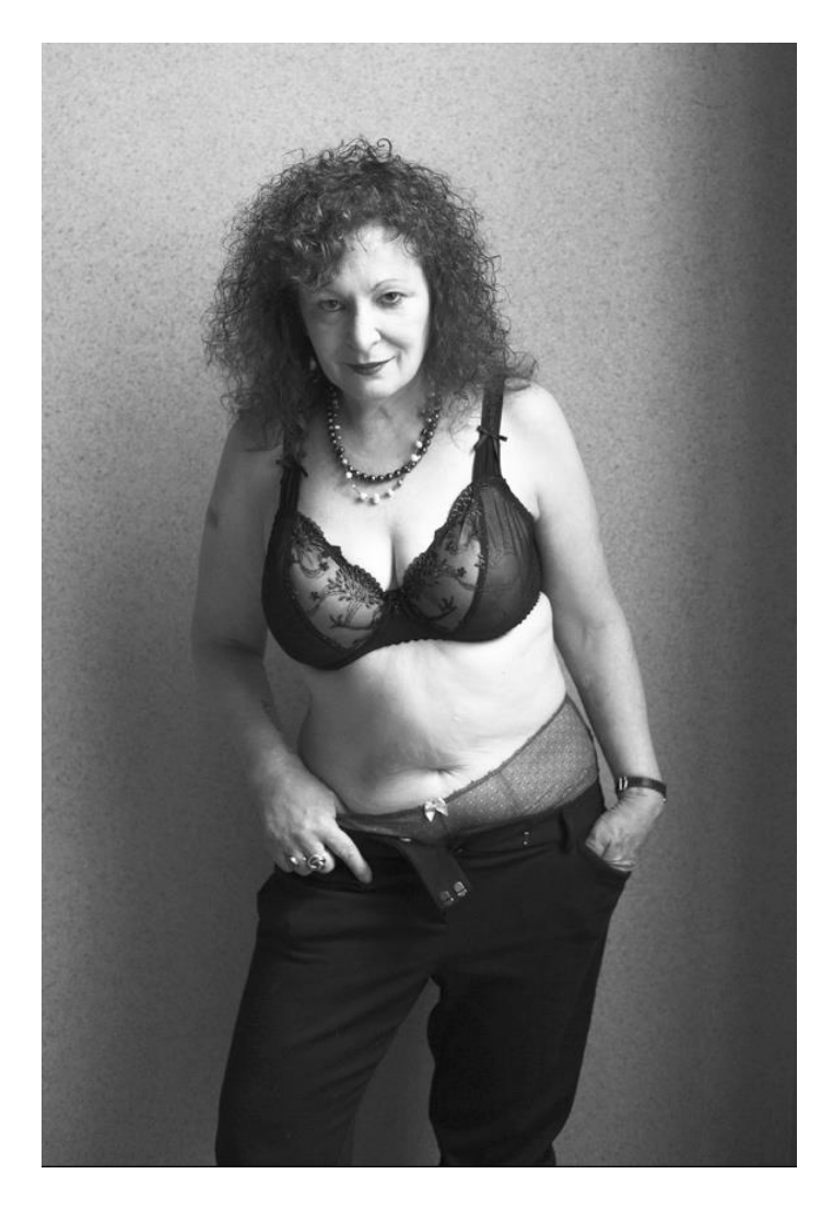
Image 5. Nan Goldin. 2013. In My Hall, Berlin. Photography.