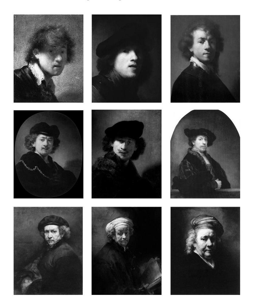
Image 2. Rembrandt van Rijn. Self-portraits dated 1629, c. 1629, c. 1629, 1633, 1634, 1640, 1659, 1661 e 1669 (from left to right, from top to bottom). Oil on canvas or wood. Recovered from [see note 1].