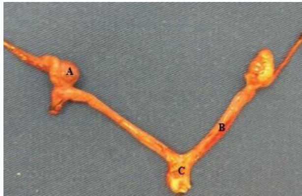
Figure 3. Female Yorkshire terrier with persistent Müllerian duct syndrome: A) testis and epididymis structure, B) uterine horn, and C) uterine body.

As previously described, PMDS is a disorder of the phenotypic sexual development that rarely affects other breeds besides the miniature Schnauzer and Basset hound (Poth et al. , 2010). Regarding the Yorkshire terrier, to our knowledge, this anomaly is rare; other researchers described a two-year-old animal with clinical, chromosomal, and internal genital characteristics similar to the present case; however, the external phenotype was intermediate between male and female; histologically, testicles had hyperplasia of Leydig and seminoma cells, and the animal showed male behaviours such as territorial marking and breeding inanimate objects (Hagel et al. , 2010).