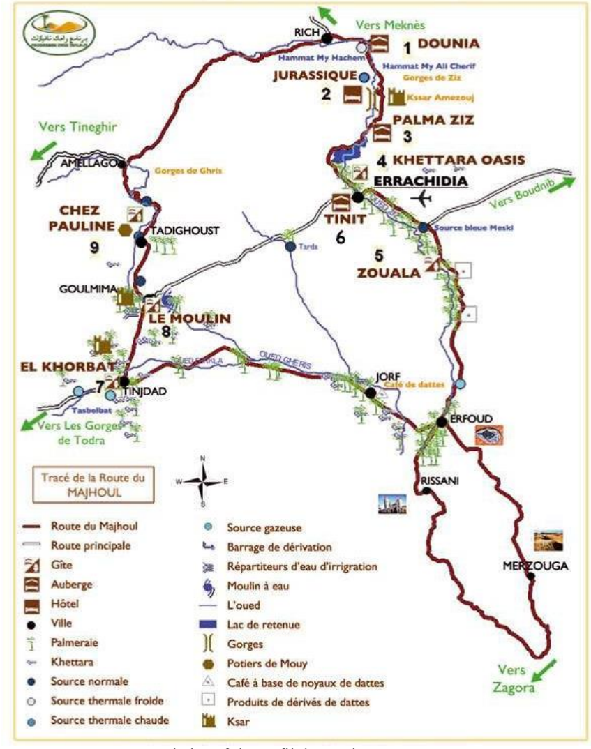
Figure1: Master tourist route of route de Majhoul road

accommodation structures has created several tensions and discordances within APECTAF, which has delayed the execution of several actions.