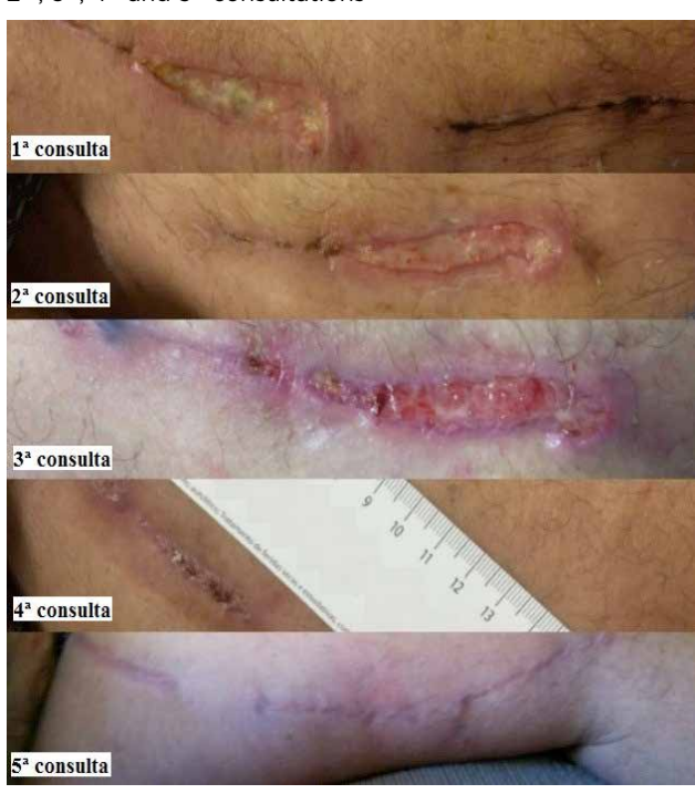
Figure 1 - Evolution of wound healing of P1 respectively 1^{st} , 2^{nd} , 3^{rd} , 4^{th} and 5^{th} consultations