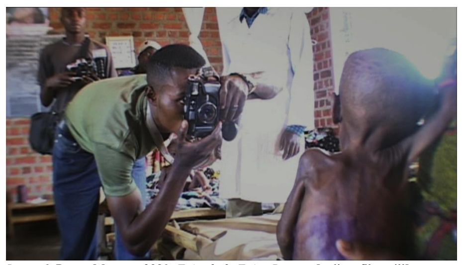
Image 1. Renzo Martens. 2009. Episode 3: Enjoy Poverty [online, film still]. Recovered from http://www.artterritories.net/?page_id=3031

The most frequent transaction in art is under the scheme in which the artist creates something special, and the public is amused, delighted or shocked by it. This set of transactions (looking for reaffirming a position "I'm OK" doing something exceptional and receiving a returning stroke of "you are OK" or at least any other stroke) could be matched with "Look Ma No Hands". This is not properly a game but a pastime but let us easily see the scheme of hungers and strokes to overcome the possible initial position of "I'm not ok.". "Look Ma No hands" could be exemplified in Olafur Eliasson's Waterfall or Chillida's Tindaya project in a hyperbolic way.