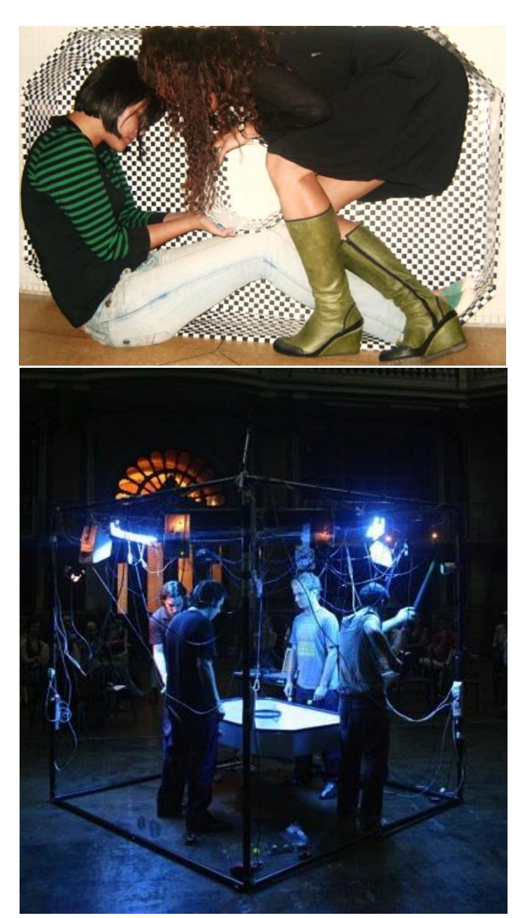
Image 6. Ricardo Basbaum. 1994 onwards. Would you like to participate in an artistic experience? [online images]. Recovered from http://www.nbp.pro.br/