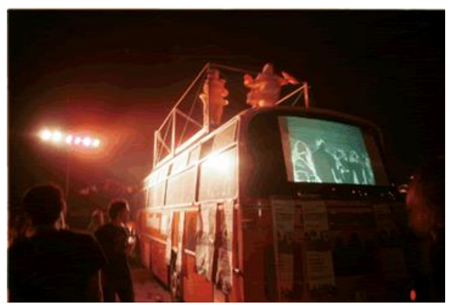
Image 7. Las Agencias. 2001. Pret à Revolter fashion show and presentation [online image]. Recovered from http://www.sindominio.net/fiambrera/web-agencias/paginas/show-bus/desfilebus/desfilebus6.hhtm

These would be examples of taking the word "relational objects" in its most literal sense as "things", but as mentioned in the beginning, we can also take the concept of "object" as "subject" or "phenomenon", and therefore, there would be also many other examples taking the object as "whatever is the matter of our actions". The catalogue Relational Objects. MACBA Collection 2002-2007 , seems to be using this wider sense of the word "objects" for compiling a diversity of artistic manifestations in their collection. From 2000 to 2008, MACBA-Museum of Contemporary Art of Barcelona was exploring other possible relations between the institution and the citizens, and as a result of that, several art projects took place, such as the workshop Direct action as one of the fine arts (2000), the project The Agencies (2001), several exhibitions such as Antagonisms. Case studies (2001), Documentary processes. Testimonial Image, subalternity and public sphere (2001), Relational poetics (2004), How do we want to be governed? (2004) and the seminar The construction of the public (2003).