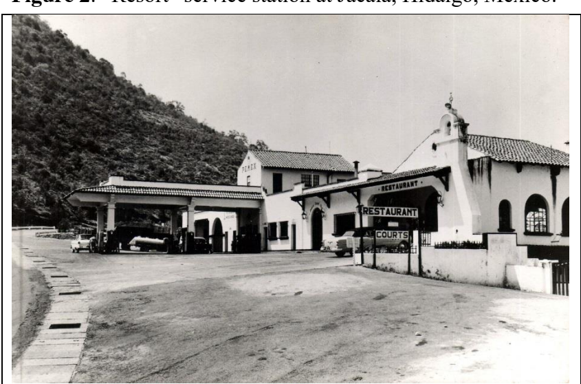
Figure 2. "Resort" service station at Jacala, Hidalgo, Mexico.