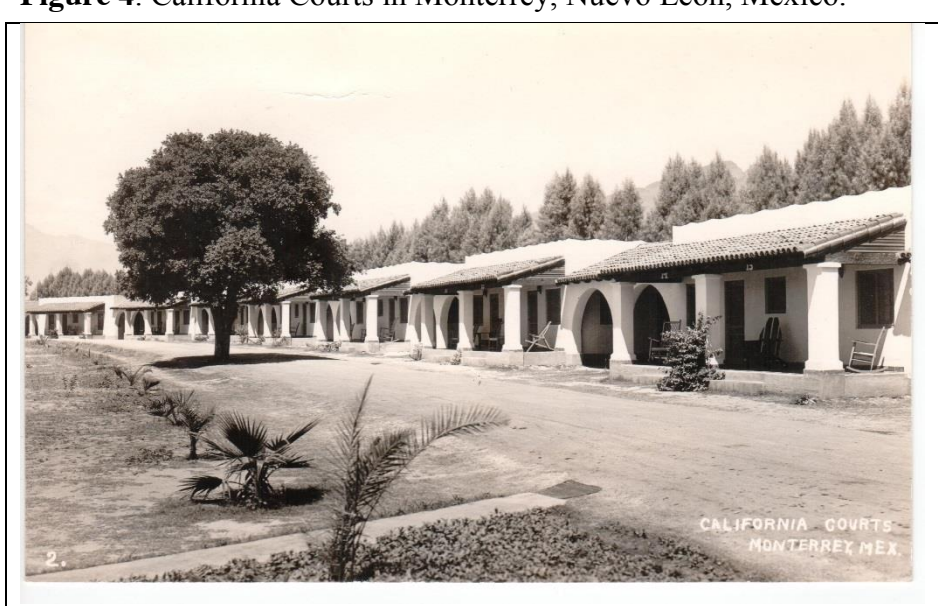
Figure 4. California Courts in Monterrey, Nuevo León, México.