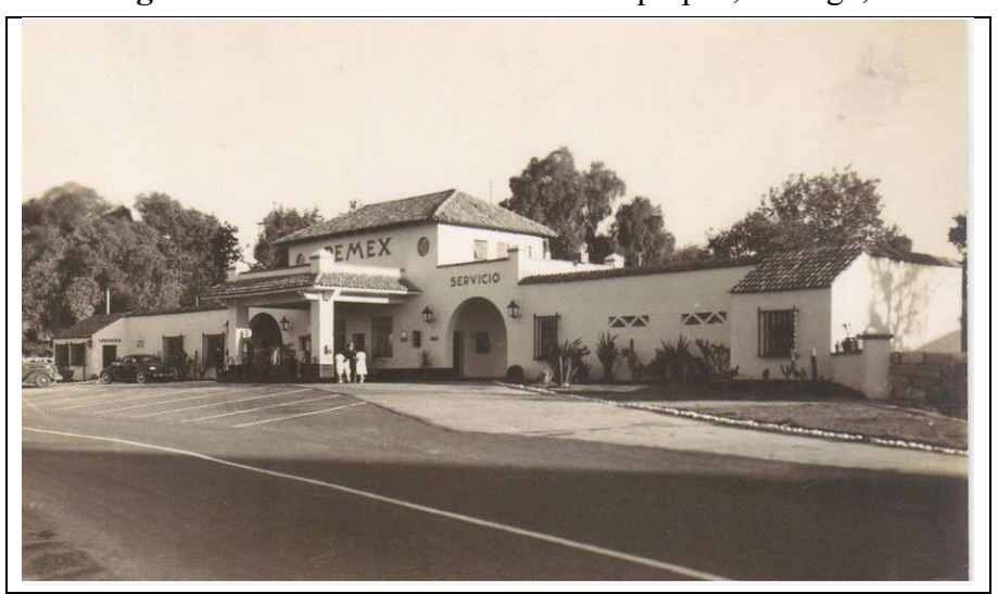
Figure 1. Dobb's Gas Station at Ixmiquilpan, Hidalgo, Mexico.