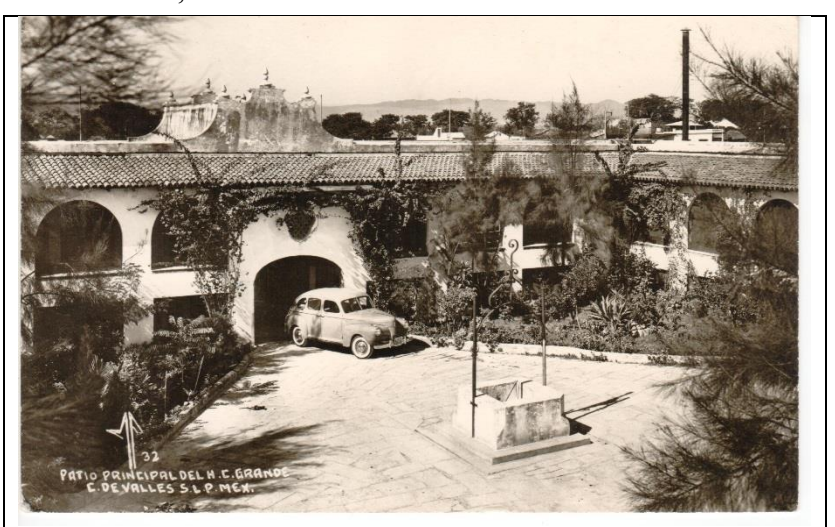
Figure 6 . View of entrance into the central court of Hotel Casa Grande in Ciudad Valles, San Luis Potosí.