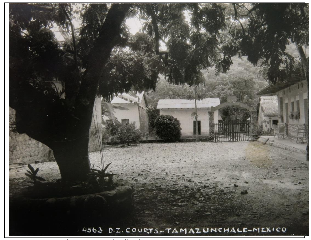
Figure 8. D. Z. Courts in Tamazunchale, San Luis Potosí.