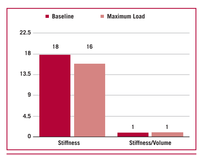
Fig. 3. Comparative values of stiffness (E/e'/LA strain \times 100) and the Stiffness/Volume index at rest and during exercise stress.

more complex and less available cardiovascular imaging techniques.