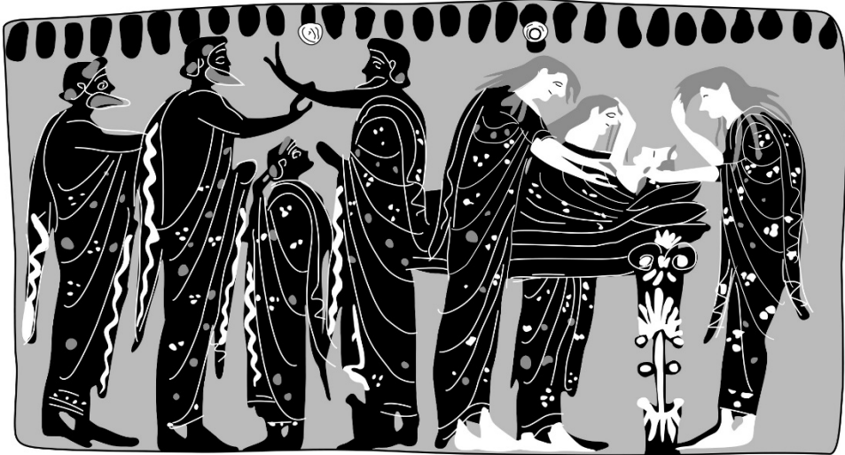
FIGURE 05 – Pinax from Walters Art Museum 48.225. Drawing: Yannis Nakas.

The black-figure plaques stopped being produced in the 5 th century BC and did not have continuity in the following technique. “Loutrophoroi did continue to be made, in black-figure and later in red-figure, although after 470 they are clearly uncommon” (Shapiro, 1991, p. 647). In our survey we have found 57 red-figure pieces decorated with prothesis : 25 loutrophoroi and two unidentified fragments are decorated with red figures while the other 31 vases – 30 lekythoi and one krater – are all white-ground with a sub-technique developed during an extremely chronologically limited period ( ca. 450-425 BC, according to Cook, 1960: 172) and serving a predominantly funerary function in Athens until the end of the 5 th century BC.