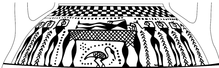
FIGURE 03 – Detail of the Amphora Athens NM 18062. Drawing: Yannis Nakas.

Gender distinctions become more and more evident through the depiction of gestures and attitudes towards the end of the LG II. On the amphora Ny Carlsberg Glyptotek 2680, in Copenhagen, we observe mourners figures with breasts and long robes. 24 The same iconographical elements of sex distinction can be observed on the amphora from the Staatliche Museen 1963.13 25 in Berlin. The typical male gesture of lamentation (Alexiou, 1974; Cavanagh and Mee, 1995) is now depicted with one of the hands in the head and the other arm raised with the hand splayed out in direction of the deceased, for instance on the