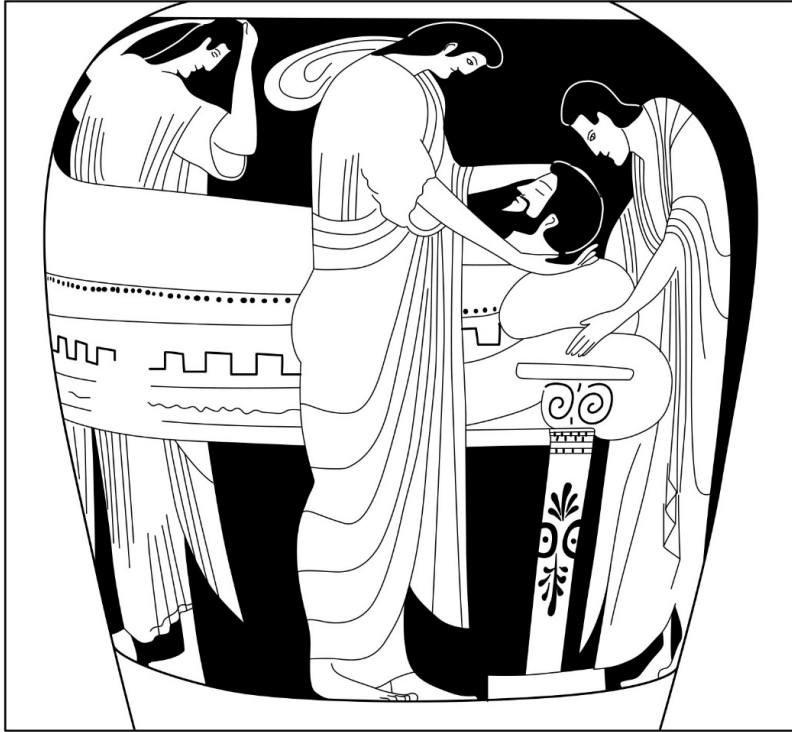
FIGURE 07 – Detail of loutrophoros from Athens, National Museum 1542. Drawing: Yannis Nakas.

Particularly interesting is a neck fragment from a loutrophoros in Berlin (Antikensammlung F2632). On one side we can observe the prothesis scene, but presented in a completely different way in comparison to the scenes seen until now: the deceased is alone. There is no escort from other characters beside or around the bier. The deceased is lying covered by a simple draped mortuary cloth on a low bed decorated in a simple manner and his head is supported by a low pillow recklessly decorated. On the other side of the fragment there is a female figure elevating her left arm towards a monument – a tomb, according to CVA BERLIN Antikensammlung 15, 52-53, pl. (4628) 52.3-6 – decorated with ribbons.