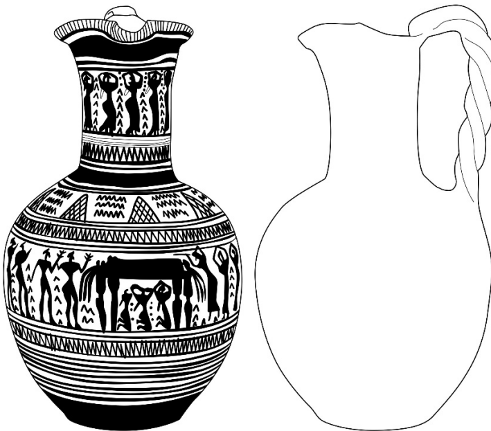
FIGURE 04 – Oinochoe CA 3283 Louvre Museum, Paris. Drawing: Yannis Nakas.

Sometimes the male mourners are depicted with one arm downwards, as we can observe on the amphora K 969 28 at the Folkwang Museum, in Essen. On this vase, it should be remarked that both female and male mourners are depicted in a row at the same iconographic panel, on the neck of the amphora, in two different horizontal bands. The distinction of gender by gesture and posture of the human figures is evidently marked by iconographic details in sex determinations and cultural elements, such as clothing and weaponry. The same differentiation of male and female mourners can also be observed on oinochoe CA 3283 29 at the Louvre Museum, in Paris (Fig. 04), on the amphora “market” in London 30 and the fragment of amphora 1370 31 at the Kerameikos Museum, in Athens.