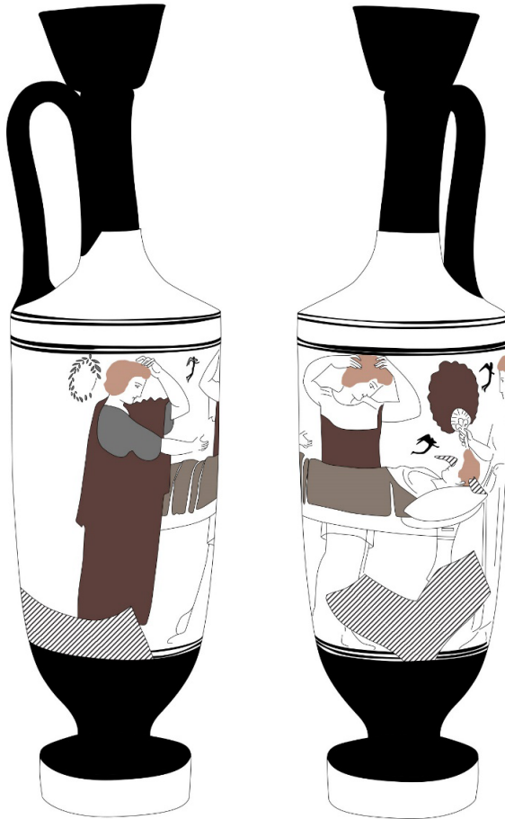
FIGURE 08 – White-ground lekythos from Vienna, Kunsthistorisches Museum 3748. Drawing: Yannis Nakas.

vases – it appears in six of the white-ground lekythoi attributed to the painter. However, wouldn't it be interesting to interpret these birds under the deceased's bier as a form of recovery, as a mnemonic element present in the geometric prothesis scenes?