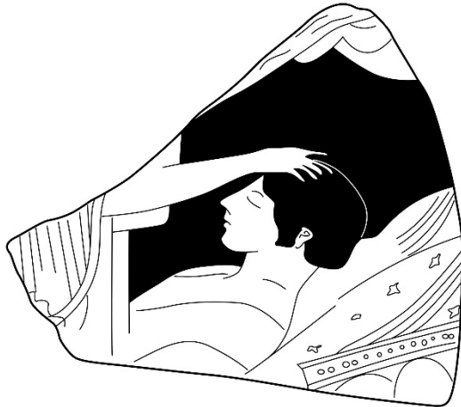
FIGURE 06 – Fragment in Vienna, Kunsthistorisches Museum 3441. Drawing: Yannis Nakas.

This touch can also be found in the loutrophoros from Athens, National Museum 1542 (Fig. 07), in which a standing figure involves the deceased’s head - a bearded man – with both hands. In this scene, however, we can observe some rigidity as the deceased’s head does not seem to be lying calmly on the pillow and his eyes are not completely shut. Once again, artistic freedom and talent must be taken into consideration, more than any other explanation that may be suggested for the scene.