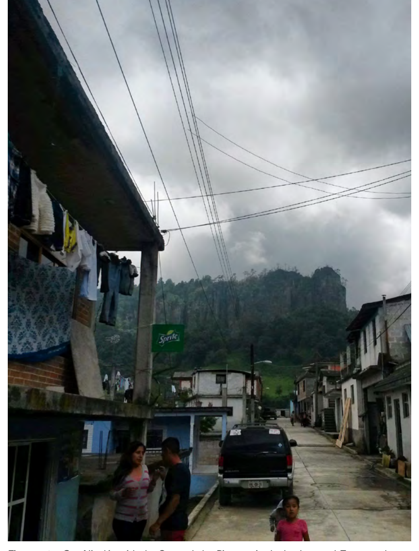
Figure 13 – San Nicolás with the Cueva de las Pinturas in the background, Tenango de Doria, Hidalgo, 2015.