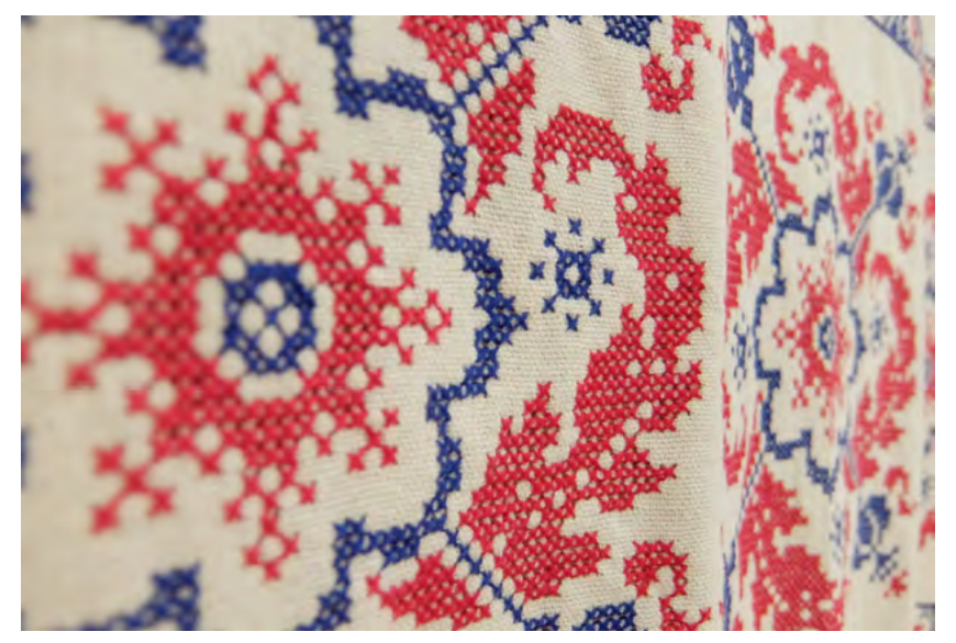
Figure 26 – Detail of embroidered rebozo, Francisca Hinojosa Torres, Morelia, Michoacan, 2015.

The journey continued to Mexico City to conduct study visits over a period of three to four days and once the itinerary was finalised, travel continued west to Michoacán to investigate Purépecha traditional embroidery. An example was purchased from Señora Francisca Torres Hinojosa (Figure 26) in Morelia featuring a style that is famed for the rose blossoms that are often surrounded by an intricate geometric border in cross-stitch needlework. They are generally rendered in harmonious colour schemes that decorate the collars and sleeves of the traditional ungaro garment worn by women. In Pátzcuaro, several embroidered samplers were purchased from Señora Rosalia Barriga (Figure 27) depicting scenes of everyday life and celebrations that were traditionally created by Purépecha mothers as heirlooms for their daughters.