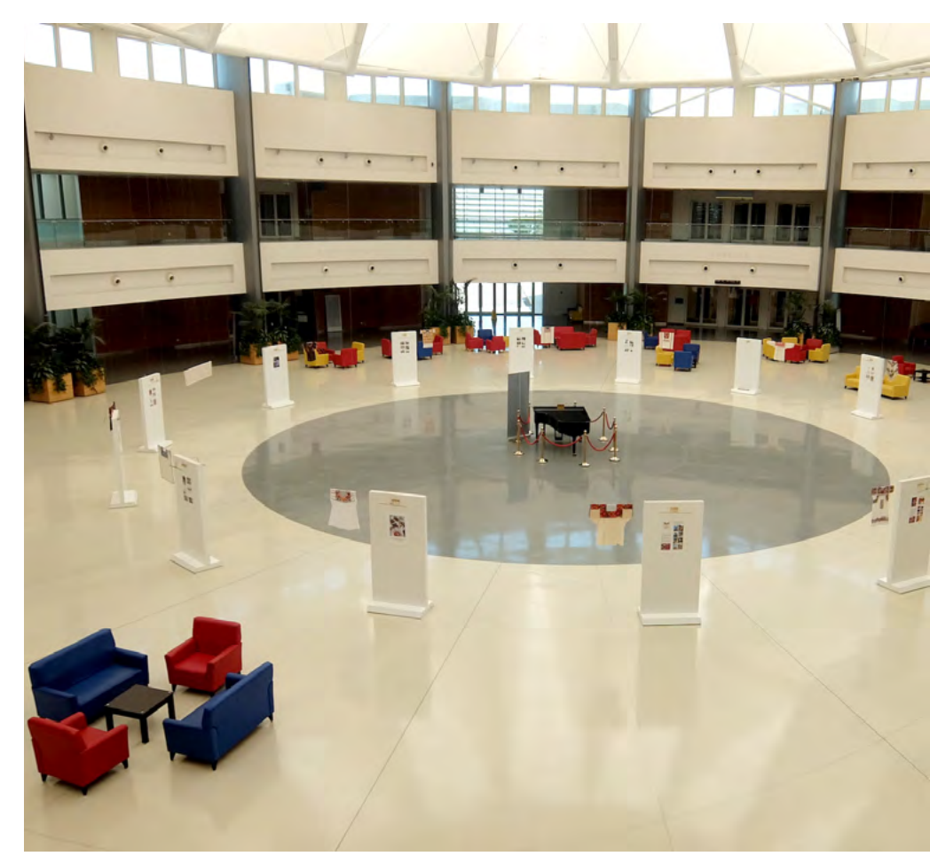
Figure 35 – Bordados: An Exhibition of Embroidered Textiles from Mexico, Paris Sorbonne University Abu Dhabi, United Arab Emirates, 2017.

The exhibition includes eighteen embroidered textiles and gives a visual overview of the cultural significance, aesthetic styles and craft techniques of embroidered textiles in the regions of Mexico that were visited. The portraits and narratives of the craftspeople are displayed alongside the corresponding embroidered textile. The accompanying written material is illustrated throughout with photographs that provide a visual reference for the descriptions of the research journey, some memories and reflections of the researcher, contextual and cultural background as well as interviews with textile scholars, ethnographers, anthropologists, government officials and co-operative managers. A common sentiment shared by the craftspeople was that the threads of their embroidered textiles are infused with their emotions, thoughts and experiences and that the textiles document a specific period in their lives as expressed through their choice of stitches, colours and design. An object made by hand is embedded with a story, be it personal, cultural or historical, but that story is often obscured once it leaves the craftsperson's studio for consumption by a customer, curator, gallery visitor, student or scholar. To convey these stories is to create a connection between the craftsperson and the consumer by continuing the narrative thread.