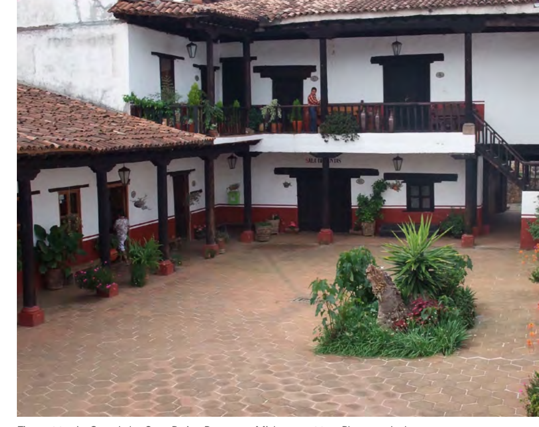
Figure 23 – La Casa de los Once Patios, Patzcuaro, Michoacan, 2015.

were not negotiated or bargained down. In order to gain an understanding