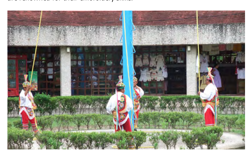
Figure 5 – Danza de los Voladores showing performers in their hand-embroidered costumes, El Tajín, Veracruz, 2015.

The first trip was to the El Centro de las Artes Indígenas de Papantla which was established to preserve the traditions of the Totonac culture in the state of Veracruz (Figure 4) in 2007. The centre is recognised by UNESCO on their list of Intangible Cultural Heritage and includes sixteen Casas Escuelas where Totonac elders share their cultural knowledge and traditions with younger generations. The Casa del Mundo del Algodón is dedicated to teaching cotton cultivation, spinning, weaving, embroidery and natural dying techniques. Public transport was taken from Xalapa to Poza Rica and then on to Papantla along the Costa Esmeralda. A colectivo was taken to the UNESCO World Heritage site El Tajín to see the performance of the Danza de los Voladores (Figure 5) which is a Pre-Hispanic ceremony performed by Totonac men to appease the rain god Xipe Tótec. As part of their vocational training the performers must embroider their own costumes in the traditional Totonac style and this is one the reasons that the men of Papantla are renowned for their embroidery skills.