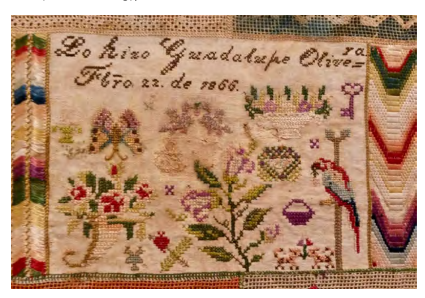
Figure 19 – Detail of 18th century embroidery sampler, In Octacatl, in Machiuyotl: Dechados de Virtud y Entereza Museo Textile de Oaxaca, 2015.

The Museo Franz Mayer holds an extensive collection of decorative arts as well as temporary exhibitions such as the El rebozo. Made in Mexico exhibition (Museo Franz Mayer, Mexico City, 2015). The influence of European colonisation on the styles, techniques and materials used in the production of decorative arts, including embroidered textiles, was evident in the displays at the museum. The circulation and dissemination of European fashions to the New World was showcased at the Hilos de Historia exhibition which showcased fashion and accessories from the 18th to the 20th century (Museo Nacional de Historia, Mexico City, 2015). European influence was explored further at In Octacatl, in Machiy tl: Dechados de Virtud y Entereza (Museo Textil de Oaxaca, 2015), an exhibition of embroidery samplers that highlighted the juxtaposition of Pre-Hispanic culture and European techniques on the development of embroidery in Mexico in the 18th century (Figure 19). Spanish styles and techniques of embroidery were introduced in the convent schools established by the missionaries and these were already infused with Egyptian, Persian, Slavic and Oriental influences.