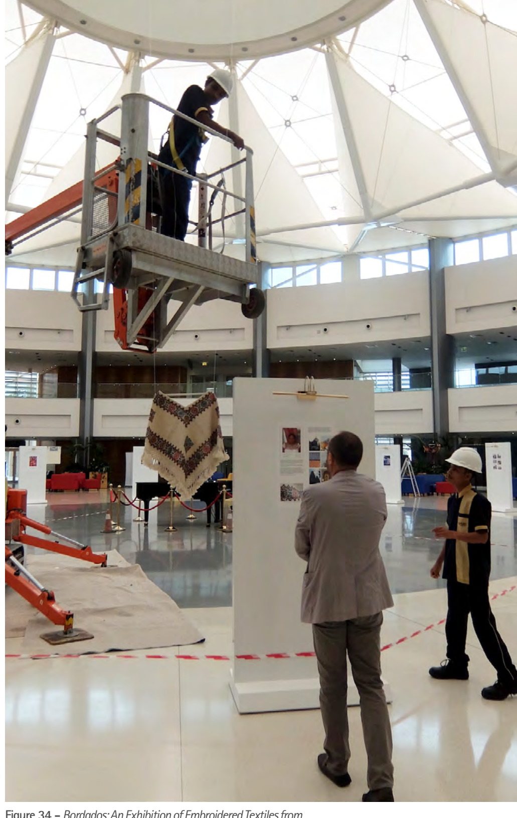
Figure 34 – Bordados: An Exhibition of Embroidered Textiles from Mexico, Paris Sorbonne University Abu Dhabi, United Arab Emirates, 2017.