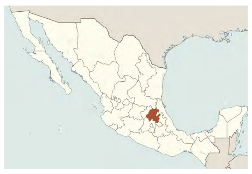
Figure 12 - Hidalgo, Mexico. Illustration by Rebecca Devaney.

The second trip was to Tenango de Doria in Hidalgo (Figure 12), a centre for a style of embroidery created by the Otomí indigenous group. Public transport was taken from Xalapa, Veracruz to Tulancingo, Hidalgo across the Sierra Madre Oriental. As the regular bus was full it was necessary to take a slower connection and overnight in Tulancingo. The following morning public transport was taken to Tenango de Doria (Figure 13) and when no commercial centres were found in the town, a visit to the local government office revealed that the embroidered textiles are only sold once a week on market day. The re-