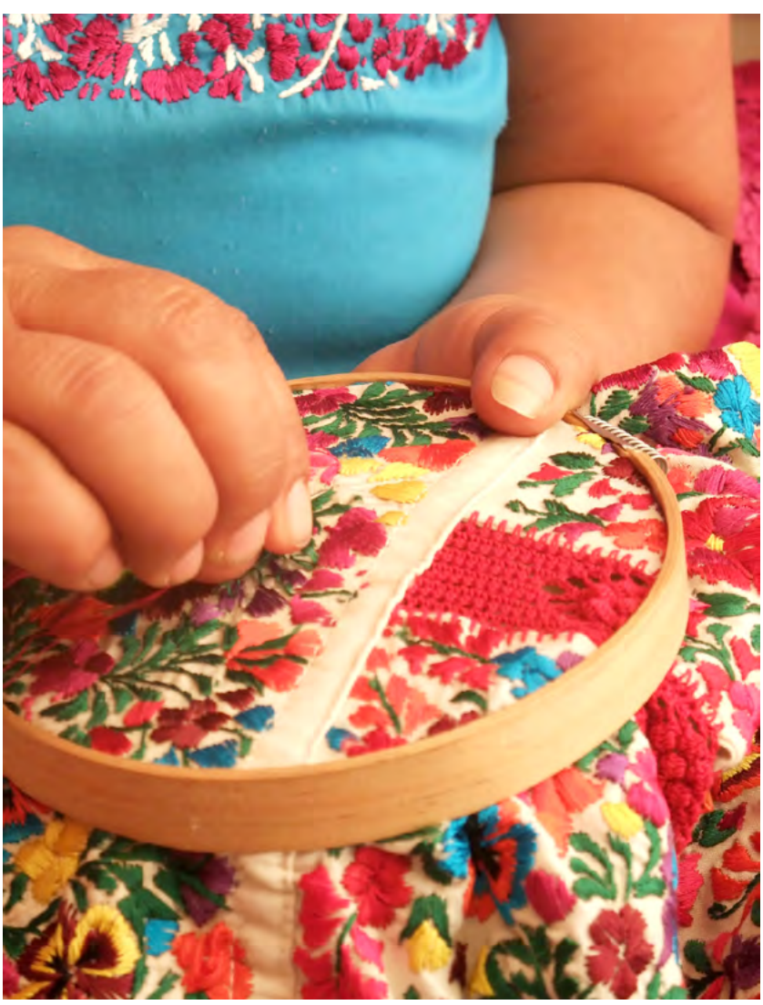
Figure 36 – Detail of embroidered blusa, Antonina Cornelio Sanchez, San Antonino, Oaxaca, 2015.

Over the five weeks of the research journey twenty-four interviews were conducted with craftspeople, members of co-operatives, textile scholars and ethnographers and eighteen examples of embroidered textiles were purchased. The possibilities indicated for further areas of study and investigation are extensive; the oral transmission of the craft of embroidery, embroidery as a traditional and intergenerational practice, initiatives to renew, preserve and develop the craft, the impact of colonisation on traditional costume, the fusion of influences in aesthetic styles introduced during colonisation and the trade routes between Europe, Asia, Africa and America, the cultural significance of symbols and motifs, communities that have organised the craft of embroidery to provide a means of subsistence and employment, the role of embroidery in providing financial independence to women, the appropriation of indigenous costume by the fashion industry (Figure 36). The wealth of museums, cultural institutions and libraries throughout Mexico facilitated the