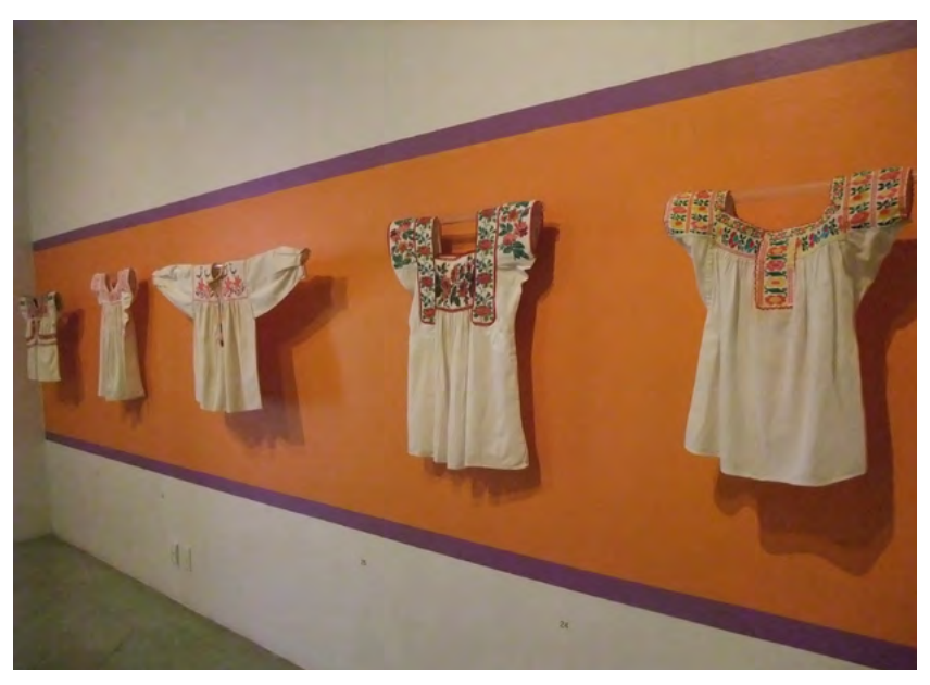
Figure 21 – El Delirio del Color: Oaxaca en los Anos 1960, Museo Textile de Oaxaca, Oaxaca City, 2015.