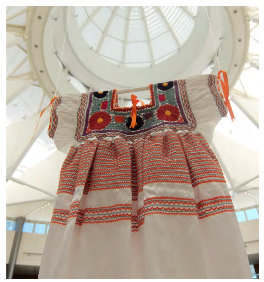
Figure 33 – Bordados: An Exhibition of Embroidered Textiles from Mexico, Paris Sorbonne University Abu Dhabi, United Arab Emirates, 2017.

The research has been disseminated to date through exhibition, presentation and online publication. The embroidered textiles, photographs, interviews and contextual research gathered over the course of the research journey have been exhibited at the Paris Sorbonne University Abu Dhabi (Figure 33, Figure 34, Figure 35), the Sharjah University College of Art and Design (United Arab Emirates, 2017) and the Mexican Embassy to Ireland (Ireland, 2016). Extracts of the research have been presented at the International Committee of Museums and Collections of Costume annual meeting, The Narrative Power of Clothes (London College of Fashion, 2017), and the online research forum, Dressing the New World (THÉPAULT, 2017). It is due to be presented at upcoming seminars in the Institut Français de la Mode and the Musée Quai Branly in Paris, France.