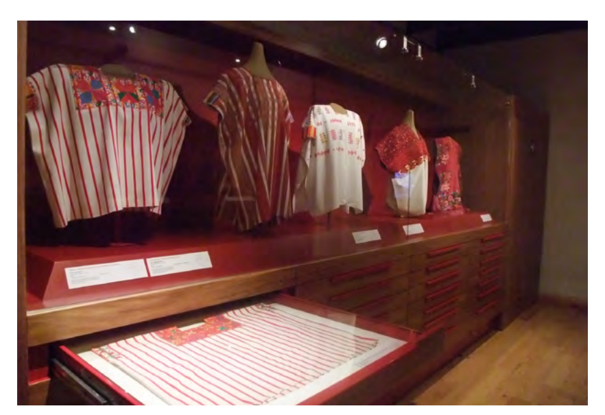
Figure 18 – Centro de Textiles Mundo Maya, San Cristóbal de las Casas, Chiapas, 2015.

Whilst the diversity of traditional costume in Mexico is astounding, women's dress generally consists of a blusa (blouse) or huipil (a loose, sleeveless tunic), a quechquémitl (a unique garment made of two rectangles of cloth that are joined in such a way that a distinctive triangle is formed front and back) or a rebozo (a shawl) and a falda (skirt). In Pre-Hispanic times these garments were traditionally made of hand-woven fabrics using natural fibres such as maguey, agave and cotton. The Europeans introduced sheep and silk-worms adding wool and silk to the available materials. Natural dyes came from bark, plants, flowers, seeds, insects and molluscs. The colours often express important meanings as blue and green signify fertility, abundance, life and water; yellow signifies the movements of the universe, corn and the death of vegetation; and red signified blood and life.