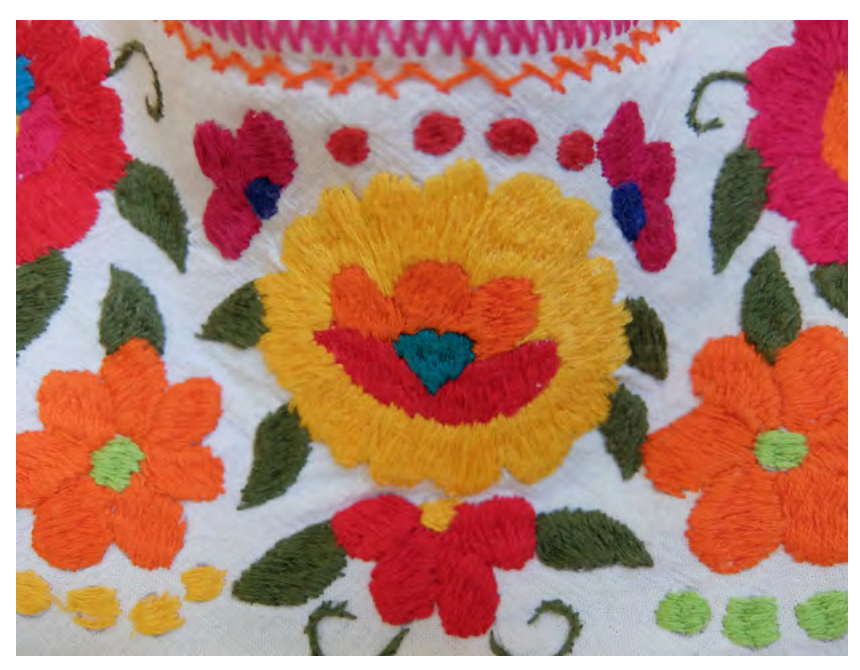
Figure 11 – Detail of Traditional Totonac blusa with floral and foliage motifs from The Tree of Life. Needlework including Punta Relleno using synthetically dyed mercerised cotton, Nicolás Xochihua Gonzalez, El Tajín, Veracruz, 2015.