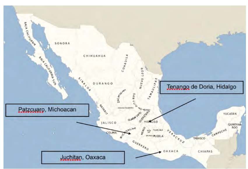
Figure 1 - Preliminary Itinerary, 2015. Illustration by Rebecca Devaney.