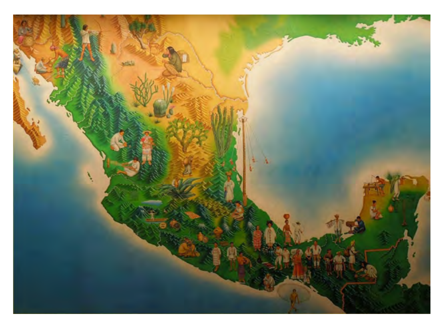
Figure 17 – Pueblos Indios De Hoy, Miguel Covarrubias, Mural Mapa de Mesoamérica, Museo Nacional de Antropología, Mexico City, 2015.

Given the qualitative nature of the field research and its focus, it was important to incorporate quantitate research to provide contextual information. Study visits were conducted throughout the research journey to identify areas of interest, inform the itinerary and to provide contextual understanding of the field research. As well as the Museo Nacional de Antropología, visits were conducted to the Museo Franz Mayer, Museo de Arte Popular and Museo Nacional de Historia in Mexico City, the Galería de Arte Popular in Veracruz, Museo Textil de Oaxaca in Oaxaca, Centro de Textiles Mundo Maya in Chiapas and Museo de Arte Popular Poblano in Puebla.