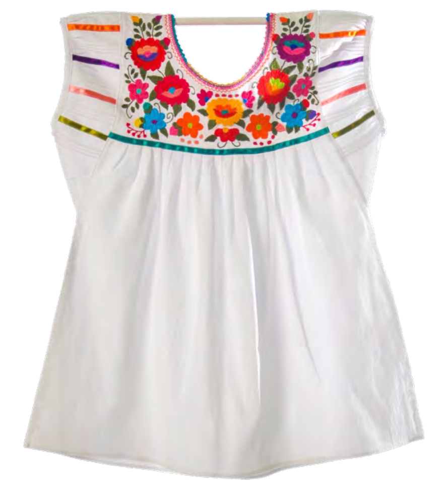
Figure 10 – Traditional Totonac blusa, Nicolás Xochihua Gonzalez, El Tajín, Veracruz, 2015.