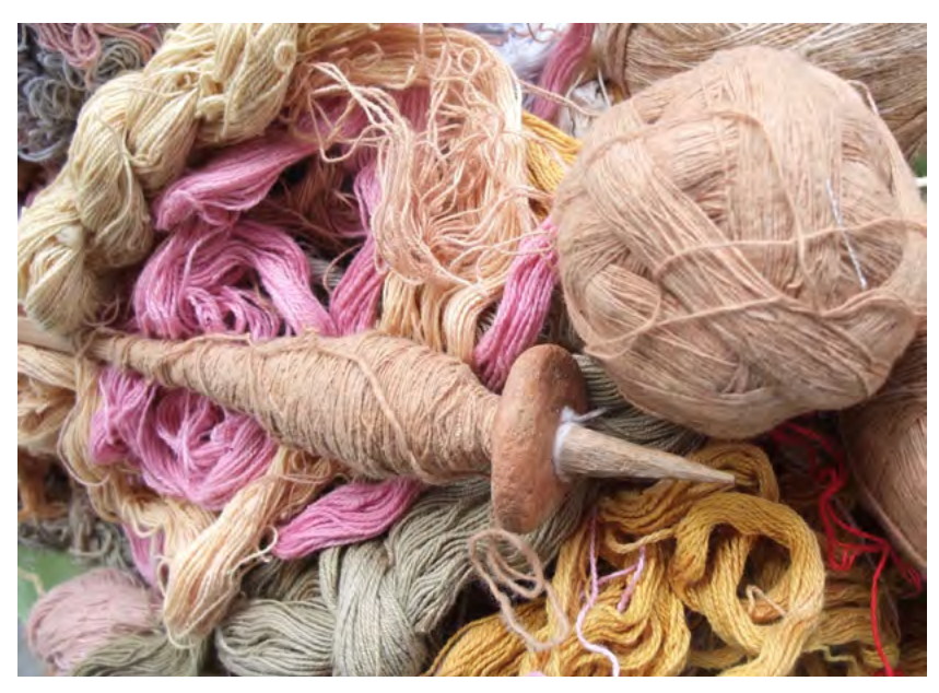
Figure 7 – Cotton embroidery floss cultivated and hand dyed using natural dyes by members of the Gonzalez family, El Tajín, Veracruz, 2015.

plants cultivated in their garden and dyed with natural plant and insect dyes (Figure 8, Figure 9, Figure 10, Figure 11).