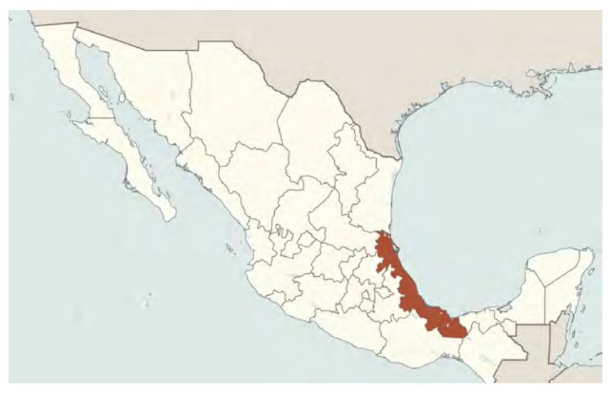
Figure 4 - Veracruz, Mexico. Illustration by Rebecca Devaney.

The first trip was to the El Centro de las Artes Indígenas de Papantla which was established to preserve the traditions of the Totonac culture in the state of Veracruz (Figure 4) in 2007. The centre is recognised by UNESCO on their list of Intangible Cultural Heritage and includes sixteen Casas Escuelas where Totonac elders share their cultural knowledge and traditions with younger generations. The Casa del Mundo del Algodón is dedicated to teaching cotton cultivation, spinning, weaving, embroidery and natural dying techniques. Public transport was taken from Xalapa to Poza Rica and then on to Papantla along the Costa Esmeralda. A colectivo was taken to the UNESCO World Heritage site El Tajín to see the performance of the Danza de los Voladores (Figure 5) which is a Pre-Hispanic ceremony performed by Totonac men to appease the rain god Xipe Tótec. As part of their vocational training the performers must embroider their own costumes in the traditional Totonac style and this is one the reasons that the men of Papantla are renowned for their embroidery skills.