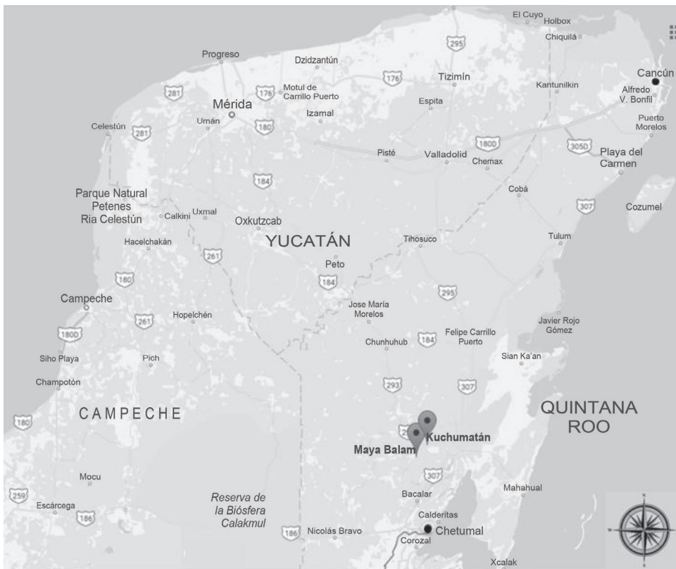
MAP 1. Geographical region of Kuchumatán and Maya Balam

community building , meant that they had the housing basics within a framework of subsistence agricultural production (agricultural plot, backyard garden). As the refugees say, We only produced to eat .