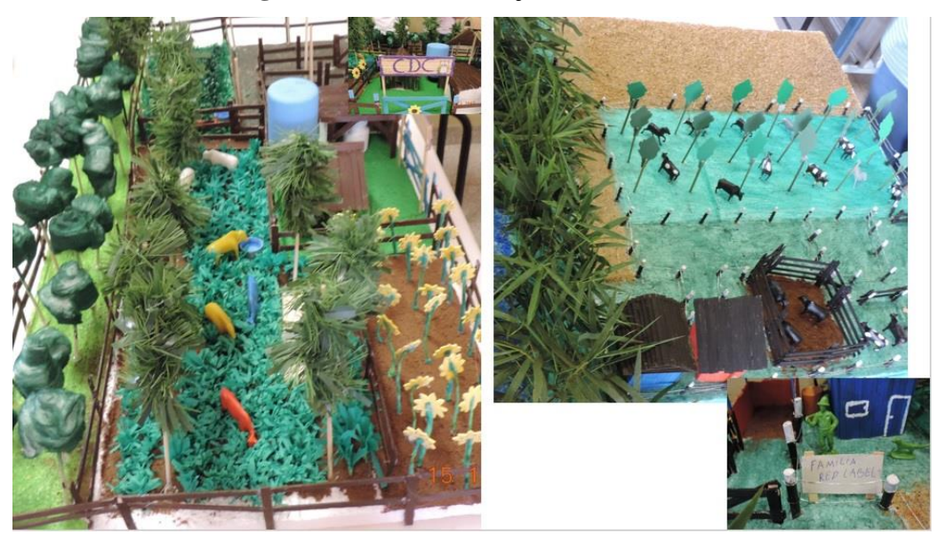
Figure 3: Clube da Coruja and Red Label