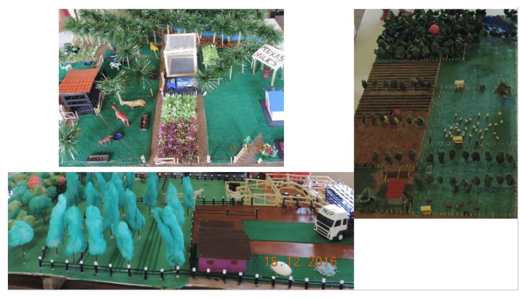
Figure 2: Stinglesh, AKIP and Team Monstro's mockups.