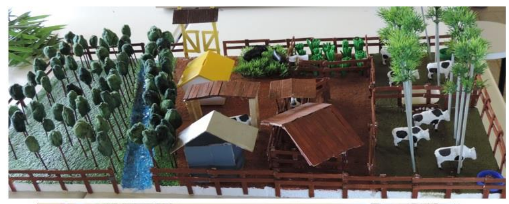
Figure 1: Pelinho de Pirraça and Team King Farm's mockups