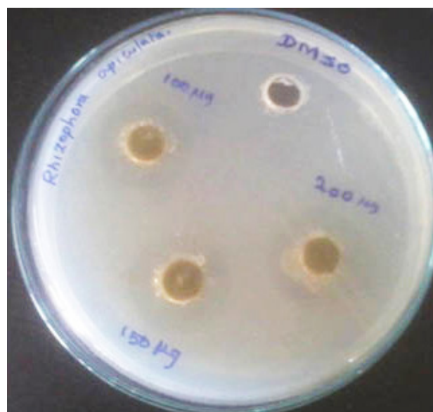
Figure 1. The extract of R. apiculata leaves showing antagonism against V. harveyi

The crude R. apiculata extract reduced the growth of V. harveyi (OD) from the fifth day. The highest OD difference compared to control was observed on the 15 th day (0.402) and the lowest on the 10 th day (0.041). The production of luminescence was decreased to 31, 44, 34, 47, 35 and