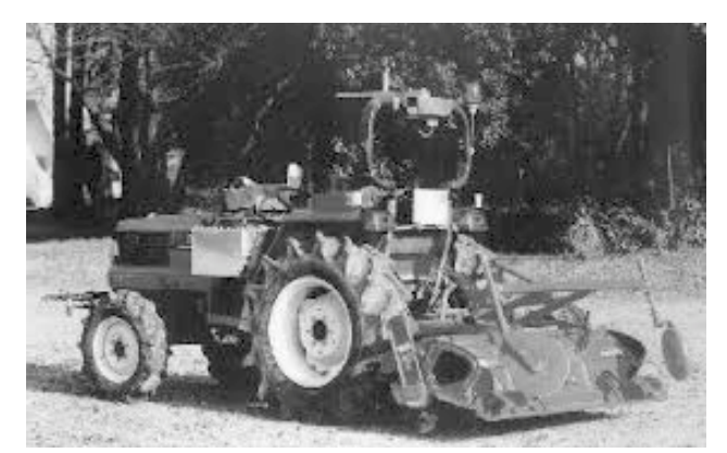
Figure 2. Robotra performing a tilling operation

to improve the plant growth. Finally, the crops need to be harvested to obtain the produce; this process depends on the type of crop.