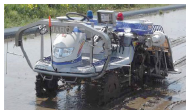
Figure 4. Rice transplanter lseki PZ60

performed manually by considering the four corners of a square field, and the path was corrected by measuring the deviation from the desired path. The same authors used another rice transplanter (Iseki PZ60), as shown in Fig. 4, with similar automation and path planning procedures (Nagasaka et al. , 2011).