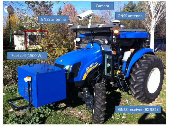
Figure 6. Modified New Holland Boomer T3050

Pérez-Ruiz et al. (2015) modified a commercial tractor into an autonomous tractor, as shown in Fig. 6. This machine was equipped with several systems, such as an intelligent spraying system and a mechanical and thermal weed control system; the system was designed especially for rows with a width of 0.25 m. A highlevel decision-making system controlled a sprayer boom that interfaced with the modified autonomous tractor for variable application of herbicides based on a prescription map and the vehicle location. Experiment were conducted in a winter wheat crop a 0.25-ha field,