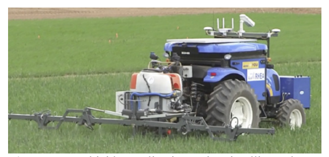
Figure 7. Herbicide application using intelligent boom spray in a wheat field

An automated combined harvester (Iseki HFG443) was modified by Nagasaka et al. (2011) for crops such