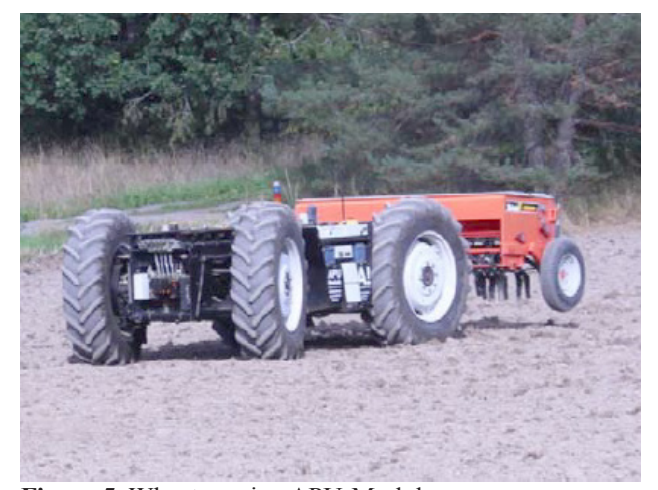
Figure 5. Wheat-sowing APU-Module

More detailed monitoring of the plant growth status and other characteristics can be achieved using multisensor data fusion technology. This technology was tested by developing a non-autonomous phenotyping multi-sensor platform attached to a tractor as a trailer (Busemeyer et al. , 2013). The platform was equipped with 3D time-of-flight (3D-TOF) cameras, a color camera, a laser distance sensor, a hyperspectral imaging system and a light curtain imaging system. The repeatability of these sensors for measuring height and coverage density were analyzed and were very high except for the 3D-TOF and laser distance sensor. The accuracy of the light curtain imaging system for determining the height was denoted by an R^2 value of 0.97 and a mean relative error (MRE) of