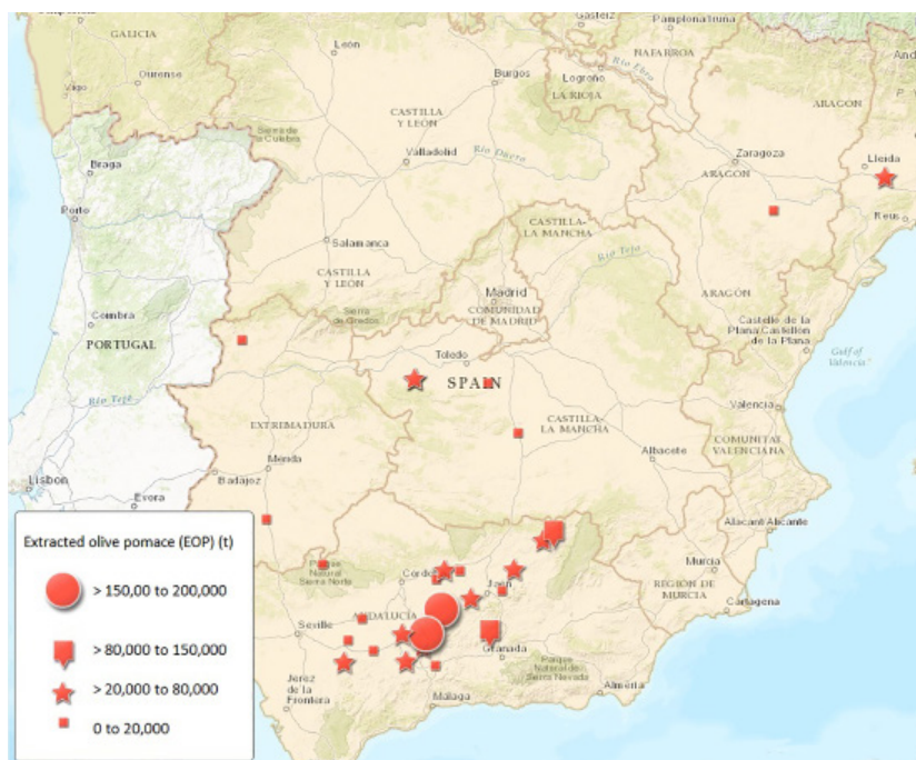
Figure 2. Map of spatial regional distribution of extracted olive pomace (EOP) production in Spain.