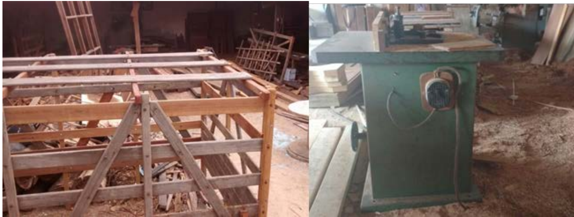
Figure 4 – Workplace

Another aspect analyzed was the organization of the workplace, considering that this factor has great impacts on the well-being and safety of the workers due to the lack of organization being a propeller to increase the accident rates. In this way, Figure 4 shows the environment where the activities are developed.