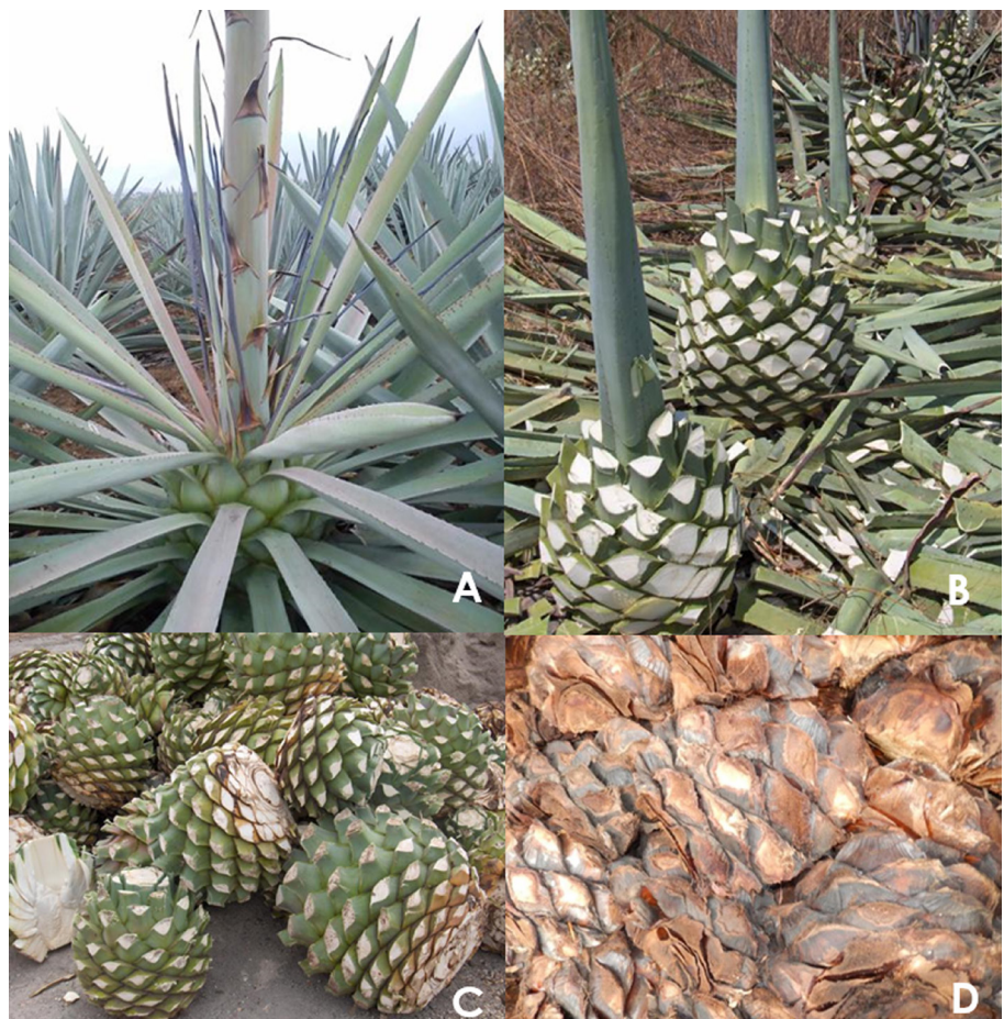
Figure 1. A) Mature Agave angustifolia Haw. suitable for processing. B) Removing the leaves to obtain "piña". C) "piñas" before baking. D) "piñas" baked.

The three materials with 0, 90 and 180 days of aging were exposed to a composting process which consisted in moving and moistening every 105 days the material as it was proposed by Íñiguez et al. (2011). The internal temperature of the piles was monitored every seven days using nine dial thermometers of 13 centimeters of diameter with a stick of 60 centimeters of length (three per pile).