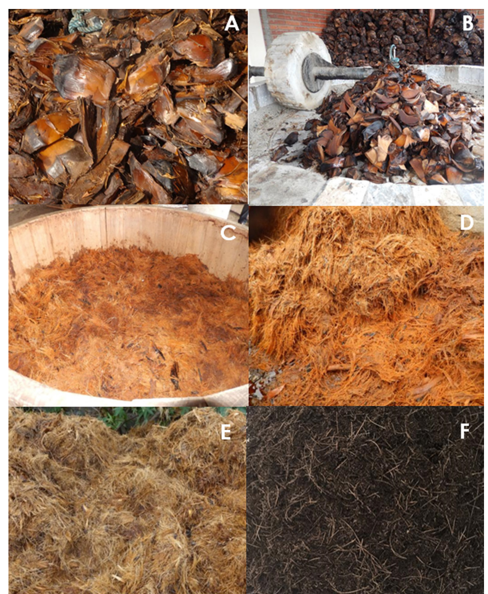
Figure 2. A) "piña" broken after baking. B) The piñas are grinded with stone wheel pulled by a horse or mule. C) Fermentation of agave for produce mezcal. D) Agave waste after fermentation and distillation yields, bagasse with 0 days of aging. E) Bagasse of 90 or 180 days of aging. F) compost bagasse.

with the neutral detergent fiber (NDF), acid detergent fiber (ADF), and acid lignin detergent (ALD), according to the technique described by Georing and Van Soest (1970). The content of hemicellulose was calculated by the difference of the (ADF) and (NDF). The loss of organic matter (OM), TOC and nitrogen were calculated according to the equations established by Íñiguez et al. (2006), and field density was determined by the TMECC (2001) technique.