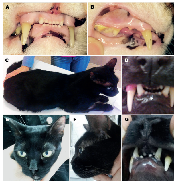
Figure 1. Cases 1A and 1B: Widened interdental space; Case 2: (C-D): C: Generalized increase in body size, D: Increase in interdental space with lower prognathism; Case 3 (E-G): E: Enlarged face; F: Lower prognathism; G: Widened interdental space with lower prognathism.

DM: Diabetes mellitus; HC: Hypertrophic cardiomyopathy.