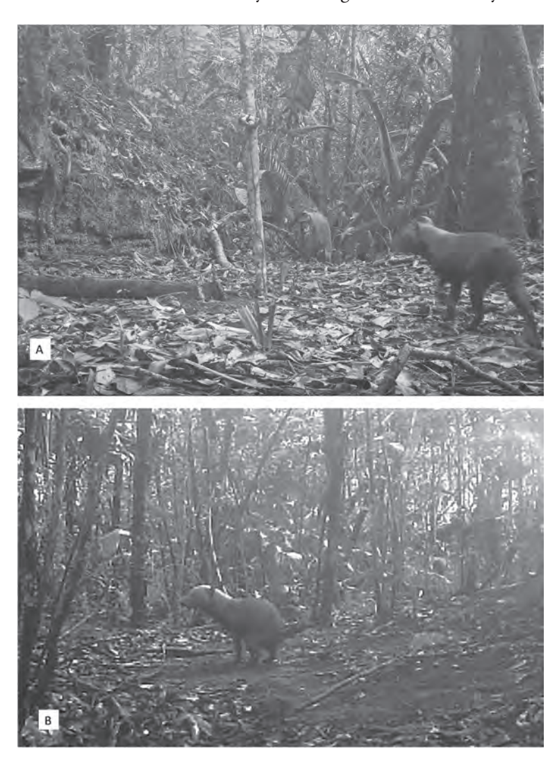
Figure 2. Camera-trap photograph of Bush dos Speothos venaticus in A) Serranía de la Lindosa (Guaviare department) and B) Llanos Orientales (Meta department).

camera-traps are providing important contributions to the knowledge of the distribution of the species throughout its range (Michalski 2010, Fusco-Costa & Ingberman 2012, Meyer et al. 2015). Due to the