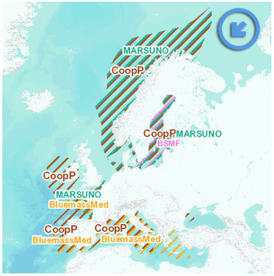
Graphic 1 - Pilot projects for the development of the CISE.