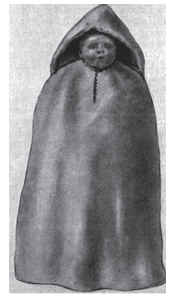
Figure 2 - Child wrapped in a cape of wool.18

The Figure 2 illustrates a newborn wrapped with a hood made of wool to maintain his body temperature.