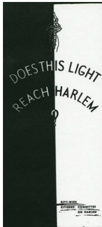
Image 1. Does this light reach Harlem? (City-Wide Citizens' Committee on Harlem, n.d.a).

Wide Citizens' Committee on Harlem used democracy's rhetoric as a vehicle for social change by characterizing the "problems presented by America's Harlems" as a test against democracy, charging that "if we fail in (the) solution, we (will) fail to make democracy work" (City-Wide Citizens' Committee on Harlem, n.d.a).