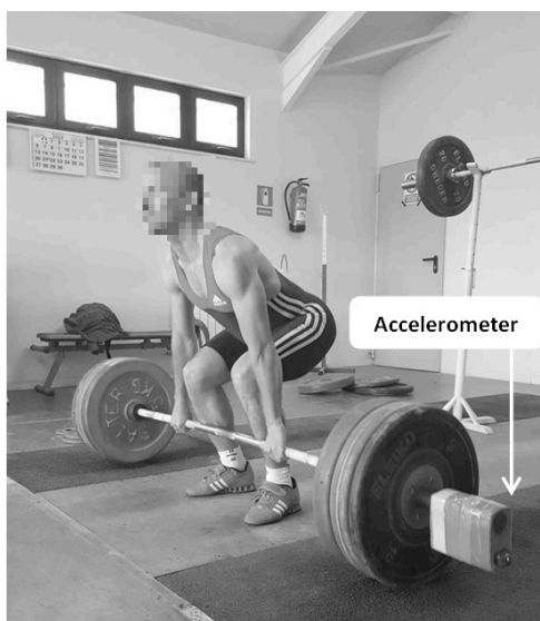
Figure 2. Weightlifter performing the lift with the accelerometer fixed to the bar as in Flores et al. (2016).

The data were processed thereafter, using Pasco Capstone software (Version 1.1.5, Pasco Scientific PASCO, Roseville, CA) and barbell peak power outputs were calculated from acceleration in accordance with the methodology explained by Thompson and Bembem (1999). In accordance with Flores et al. (2016), data analysis included only the vertical acceleration attained by the barbell that was lifted, and only up to the finish of pull phase for snatch and clean, and up to the highest point of the bar's path before the catch position for back jerk and jerk. It should be noted that the lifter's body weight was not included in the calculations, so that the power calculations recorded the work done against the bar by the lifter. This exclusion of the body weight in the calculations gives more crucial information about weightlifting performance, because the success of weightlifting depends on the power applied to the barbell, which moves independently of the body, and on how high the lifter can pull the barbell (in the snatch and clean) or drive it (in the jerk), regardless of the lifter's body mass (Hori et al., 2006; Hori et al., 2007; Kawamori et al., 2005; McBride et al., 2011). In that sense, specific measurement of the power applied to the barbell may be the primary outcome measure when assessing weightlifting performance (Hori et al., 2006; Hori et al., 2007; Kawamori et al., 2005; McBride et al., 2011).