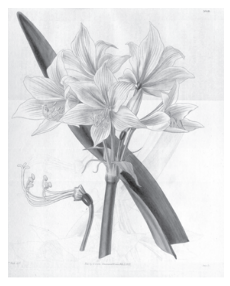
FIGURE 2 – Hippeastrum breviflorum Herb. Illustration extracted from Curtis's Botanical Magazine, v. 11, t. 3549, 1837.

differt pseudocolo breviore (usque 4.3 cm vs. usque 10 cm); foliis latioribus usque 4 cm, absentibus in anthese, nervuris centralibus conspicuis, marginibus non hialinis (vs. folia usque 2 cm lata, dilatatae in anthese, nervuris inconspicuis, marginines hialinae); floribus pedicellis longioribus (usque 8 cm vs. usque 4.5 cm); tepalis coloris distintae in margine basali nervurae centro-longitudinalis (rubicunda vs. absens); paraperigonio fimbriis attenuatis et irregulariter dispositis, in glomeraminibus intermissis (vs. fimbriae latae, regulariter dispositae, in annulo).