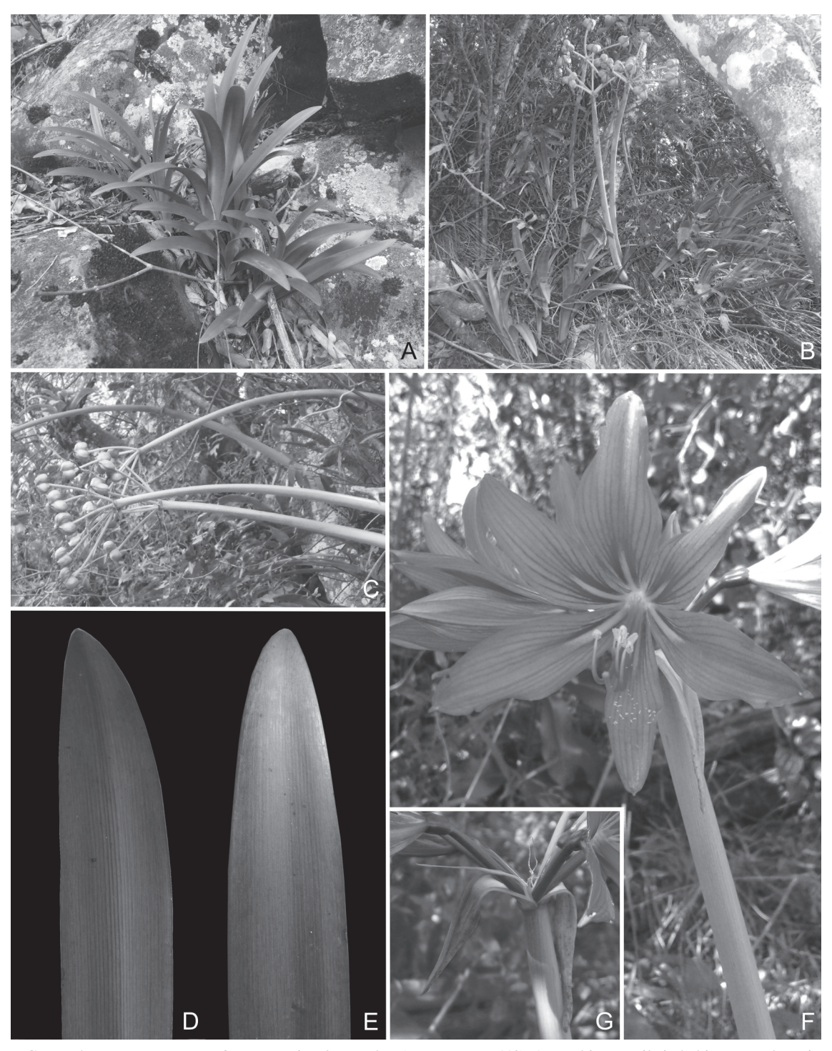
FIGURE 4 – Hippeastrum ramboi R. Bastian & Büneker ( R.E. Bastian 112 ). A – Habitus sterile in habitat. B – Plants in fruiting. C – Fruiting detail. D – Abaxial face of the upper portion of a sheet. E – Adaxial face of the upper portion of a sheet. F – Inflorescences. G – Detail of the inflorescence bracts.