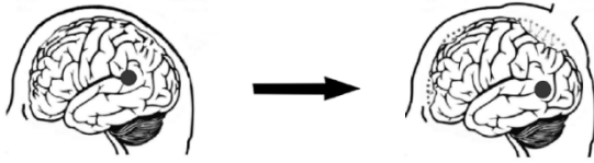
Fig. 2. Brain shift caused by the opening of the dura mater.

Intraoperative imaging technologies that use magnetic resonance imaging (iMRI) [58], computed tomography [59] and ultrasound [60] have been shown to be beneficial for resection control as well as detection of brain changes [1]. iMRI in particular offers a very convenient solution to obtain several surgically relevant parameters such as the location and edge of the tumor as well as functional brain parameters (e.g., blood flow perfusion and chemical composition) [61]. Currently, the main way to deal with the brain shift problem during neurosurgery is the use of intraoperative magnetic resonance imaging. Nevertheless, intraoperative imaging techniques are classified as invasive methods, since the body is exposed to the harmful effects of magnetic fields and X-rays [62]. In addition, neurosurgery rooms equipped with iMRI are not very common in the vast majority of hospitals because of their high cost and the fact that all surgical instruments and anesthesia equipment must be suitable to be used in such an environment [16]. Another aspect to keep in mind is that, with the use of iMRI, the time of each scan extends by about 20 min [63] and the flow of information can be interrupted during the neurosurgery [25].