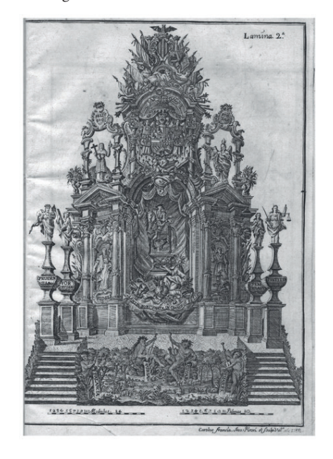
Image 7. Oath stage for Charles III in the Plaza de la Seo in Valencia

The oath stages set up in the Llano del Real and the Plaza del Mercado , where the second and third acts of proclamation took place, were simpler, although there was constant allusion to the abundance of the kingdom in the form of cornucopias. Even more interesting was the altar set up in the Plaza de la Seo opposite the stage on which the first act of proclamation took place. A huge canvas painted in perspective represented a magnificent architectural creation (Image 7). It was the creation of Carlos Francia, the famous painter of flowers and garden views who also made the engravings for the account of the festivities. The view included a niche in which a huge equestrian statue of Charles III was placed. The allegorical figure of Valencia portrayed as Minerva appears at his feet offering up instruments of mathematics and the arts on a tray. Her face is covered by a sun, and flowers, fruits and medals flow from a cornucopia at her feet. The inscription —Valencia Fortunata in omnibus felix— clearly alludes to the happiness and fortune of the realm: "How the sciences flourish and shine in Valencia and how much more they will flourish and shine encouraged by the rays and influences of the new Sun."<sup>45</sup>