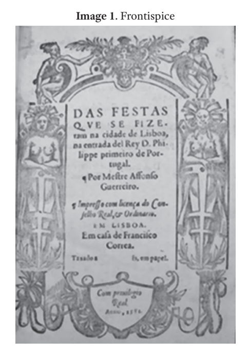
Source: Unknown engraver, "Frontispice," in Alfonso Guerreiro, Das Festas que se fizeram na cidade de Lisboa, na entrada del Rey D. Philippe primeiro de Portugal (Lisbon: Francisco Correa, 1581), 1.

respect the privileges of Portuguese cities,<sup>14</sup> and to defend and protect the kingdom, as well as to propagate the Catholic faith (Image 1). Beside that figure, the allegory of Lusitania was portrayed kneeling before the figure of the prince, offering him a golden ring and the coat of arms of Portugal and the Algarve as a symbol of obedience. Thus, at the same time the prince was reminded that he must comply with his obligations of defense and respect, the German merchants living in Lisbon offered their submission.