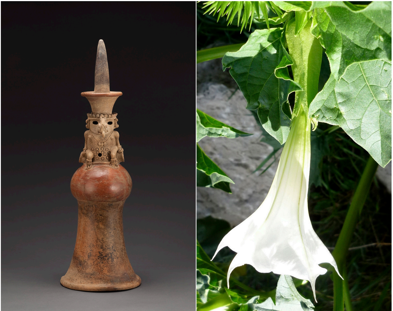
Figure 3: (left) Potosí censer lid argued to represent an upside down Datura stramonium flower (see Wingfield 2009:232, 661). Incense Burner Lid with Seated Figure, AD 500—800 Greater Nicoya, Nicaragua, Costa Rica Denver Art Museum Collection: Gift of Frederick and Jan Mayer, 1995.437; (right) Flower of Datura stramonium.

fruit (or seed?) is represented on these censers for two reasons. First, it is currently difficult to deduce if there is an association between what is burned inside the vessel and what is represented on the outside, and second, many seed pods and fruits have a rather generic oval shape. Based on the small number of samples under review, it is currently difficult to determine the exact fruit/seed being shown. However, in the case of Figure 4 , I believe a cacao fruit pod is being represented as the effigy.