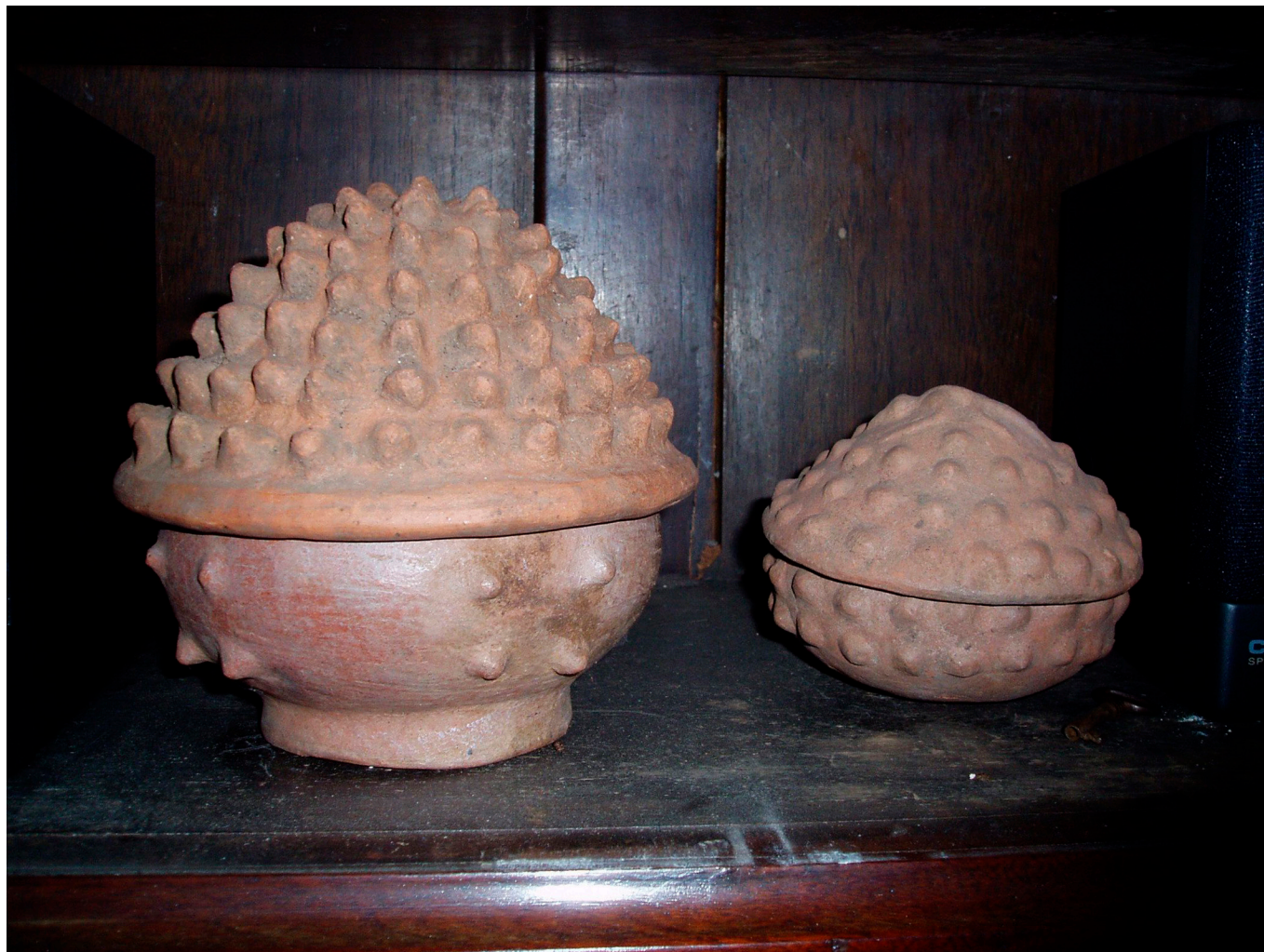
Figure 16: Potosí censers from the Arguello private collection, Nicaragua.

As previously mentioned, the intention in presenting this hypothesis and model is for re-evaluation using multiple lines of evidence, in this case building toward a future synthesis of iconographic and ethno-botanical analyses to expand our understanding of these important ceramics. Previous studies have tended to remove symbols from their practical contexts and physical world representations; they haven't then been amicably interpreted in artistic manners. I hope that future research can begin to tie the physical realm in which these communities lived to their artistic interpretations in the ceramic record. We must focus more strongly on multidisciplinary research if we are to better understand what is represented on these ceramics and how they were used.