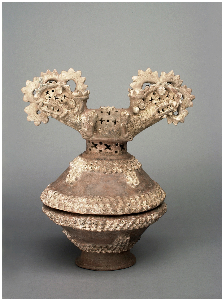
Figure 1: Potosí Applique with crocodile effigy. Visible cluster applique as well as the rim banding. Double-headed Reptile Incense Burner, AD 500-800 Greater Nicoya, Nicaragua, Costa Rica Denver Art Museum Collection: Gift of Frederick and Jan Mayer, 1993.592A-B

as far as coastal regions of Ecuador and the Chorrera culture (950-350 BC). In recent years, analysis of Potosí Applique in general has become somewhat stagnant, perhaps because the vessel's function is one of the most obvious in Greater Nicoya. As the most frequently published and republished images of Potosí Applique often show a crocodile and/or volcano effigy (see Figure 1 ), there has seemed to be no interest in further questioning the role of the applique designs. The “standardized and limited set of decorative features” ( Dennett, 2016, p. 300 ), in addition to the lack of real understanding of the position of Potosí Applique in the broader ceramic assemblage across time and place has resulted in regurgitation by scholars of the same poignant design elements at the expense of many others that exist within the type, resulting in a lack of further exploration of the ceramic type.