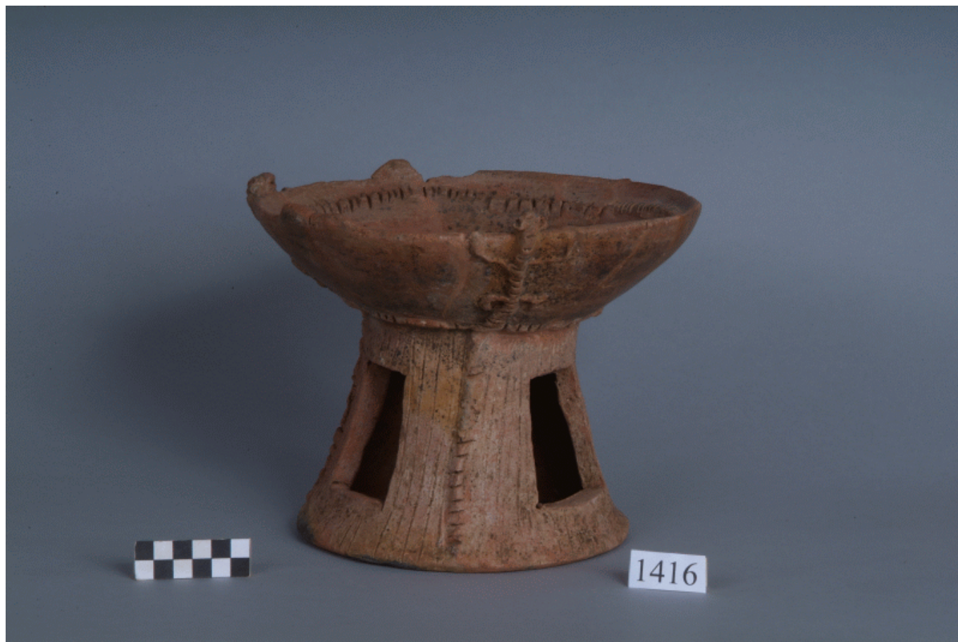
Figure 5: Potosí censer base with gecko-like creature adorning the rim.

The third observation is variation in the use of cut-outs and vent styles and, in some cases, the complete lack of a ventilation system. The most notable use of the vent hole as a mechanism for intensifying ritual experience can be seen with the fantastic crocodile version of Potosí (see Figure 1 ), where smoke is channelled out through the elaborately modelled crocodile snout. Incense, by definition, is used for the smell provided by the organic material, thus I feel that the crocodile smoke reference may be somewhat misguided. These vents may be more related to artistic, or most likely practical reasoning such as ensuring heat can be released from the ceramic during firing in manufacture. While a mythical smoking crocodile creates a fantastic image in our minds, the lack of consistency in location of vents or presence of vents suggests to me that this was not a purposeful manufacturing element by the artisans, but rather an integrated technical requirement. Furthermore, it is difficult to determine what type of environment the censers were used in; dry season versus wet season or general geographical location relative to environmental elements may have affected smoke patterns. I have noticed three general patterns to the cut-outs and venting style present on the Potosí censer base: Figure 5 demonstrates the large artistic rectangular cut-outs, Figure 13