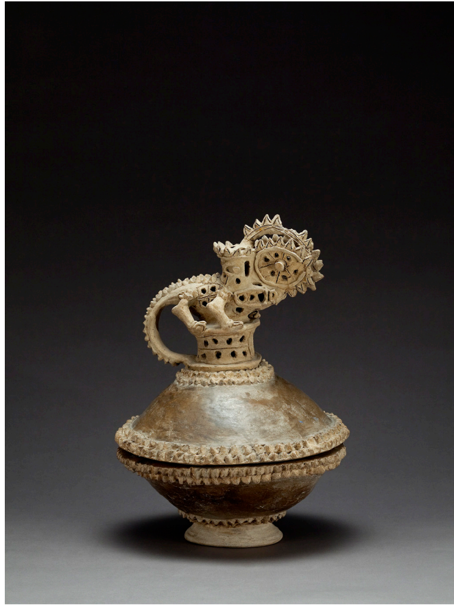
Figure 10: Potosí censer with banding focused on upper and lower edges. Incense Burner With Fantastic Reptile, AD 500-800 Greater Nicoya, Nicaragua, Costa Rica Denver Art Museum: Collection of Frederick and Jan Mayer

and ceremony took place currently makes this question very difficult to answer. Figure 14 shows a small circular vent similar to a censer from Copan (see Hough [1912: Figure 3]). Worth mentioning is the fact that the vessel used by Hough (1912: Figure 3) in discussion of transportation methods also exhibits pointy applique pellets, although the vessel he demonstrates is from the site of Copan, Honduras. The spikes have also been discussed as a grip to hold the vessel, and disperse heat away to prevent the carrier's hands from burning (Deal, 1982; Houston, 2014). This is an interesting idea, but in the case of Potosí from Greater Nicoya, the variation seen in applique design suggests this may not have been the intention of the applique. In many cases, however, it seems that vent holes on the effigies or closed parts of the censers are simply designed to prevent the ceramics from breaking or exploding during the firing process.