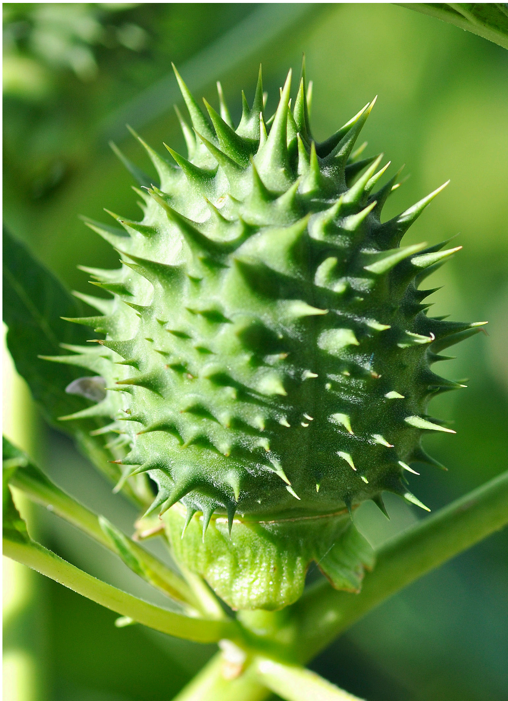
Figure 15: Datura fruit pod.