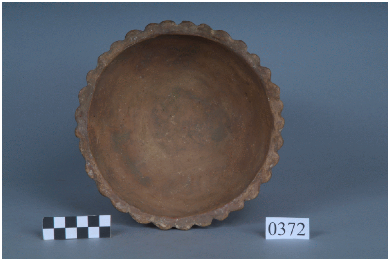
Figure 11: Bird's eye view of Potosí censer base with scalloped rim profile.

The applique pellets on censers from other geographic locations has been compared to tree bark, particularly the Ceiba tree, due to the obvious visual similarities (for example Dreiss and Greehill [2008]; Houston [2014]; Kidder [1950]; Kurnick [2009]; Pennacchio, Jefferson, and Havens [2010]). Censer vessel forms from the Condega Museum in northern Nicaragua are reminiscent of the spikey vessels found in northern Central America, which are said to resemble Ceiba bark. In some cases, this is perhaps what is being mimicked on the Potosí surface, especially in cases where the pellets are uniform across the surface and of a taller, pointier nature. In ritual ceremony these specific Potosí vessels might act as a 'tree' or axis mundi connecting the physical realm to the spiritual one either below or above the surface of the earth depending on the ritual (Houston [2014]; Kurnick [2009]). I question if the wide variation in stylistic pellet renderings across the Potosí varieties has blurred our ability to recognize this as a potential option in Greater Nicoya. Figure 5 demonstrates linear incising reminiscent of the bark striations present on tree trunks, in addition to the general tree trunk form with incense perhaps representing the center of the tree. The lack of consistent design in the shape of the pellets and vessels that have non-uniform pellet designs, however, raise new