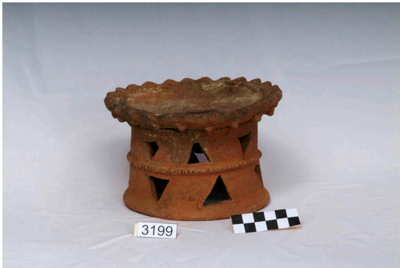
Figure 13: Triangular cut-outs on Potosí censer base.

There are a large number of vessels that have different geometric patterns in the place of the pellets. Rather than representing an entire plant pod, I suggest that these pellets are actually individual fruit or seedpods. One potential hypothesis is the use of Morning Glory ( Convolvulaceae ) seeds based on evidence for their pre-Columbian consumption from the Florentine codex (Sahagún, 1963). The use of Morning Glory seeds seems to have been focused in the Oaxaca region of Mexico, as well, where its use has been observed in divination by a Zapotec shaman (Schultes, 1998; Stafford, 2013). Cacao seed applique is similarly observed on censers from the Maya area, which has been suggested to “symbolize the human heart and that chocolate -the liquid made from the seeds of those pods- symbolizes human blood” (Kurnick, 2009). Larry Steinbrenner (2006) provides an excellent summary of the ethnohistoric accounts of cacao in Greater Nicoya, noting contact-period plantations identified across Pacific Nicaragua. Steinbrenner (2006, p. 269) suggests “cacao was known and used in Lower Central America before the arrival of the Mesoamericans” ca. AD 800. Bergmann (1969: Fig. 1) noted that the Rivas region was a secondary location for cacao cultivation. The large quantity of Potosí recovered from the Rivas and Ometepe archaeological zone (Healy,