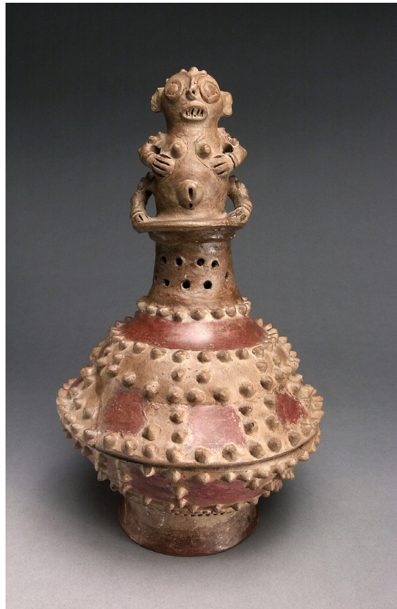
Figure 9: Potosí censer applique banding with vertical clusters. Lidded Incense Burner with Female Figure, AD 500-800 Greater Nicoya, Nicaragua, Costa Rica Denver Art Museum Collection: Gift of Frederick and Jan Mayer, 1995.699A-B

vessels seen in many collections I have reviewed. Important to note, Figure 4 contains an incised ‘x’ on the upper region of applique pellets though it does not penetrate through the vessel to create a vent. It is possible that specific vessels with the cross and/or ‘x’ held higher power when combined with other censers. I have discussed elsewhere (see Dennett and Platz [2017b]) the symbolic relationship to the creator couple concepts from the broader Zapotec religious cult. I hypothesize that this concept may have been drawn upon during ritual ceremonies using the censers to increase the power of the ritual and perhaps the combination of incense used.