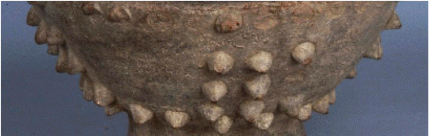
Figure 6: Potosí censer spiked pellet detail.