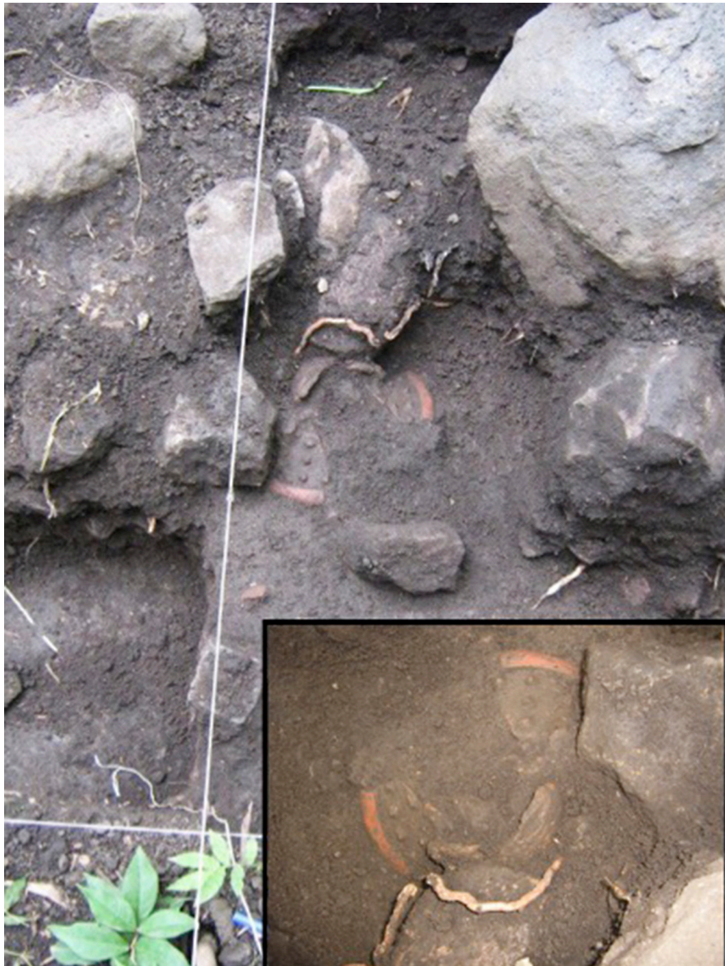
Figure 2: Santos variety Potosi Applique from Locus 2 of El Rayo, Nicaragua, inset photo is a close up of the ceramic.