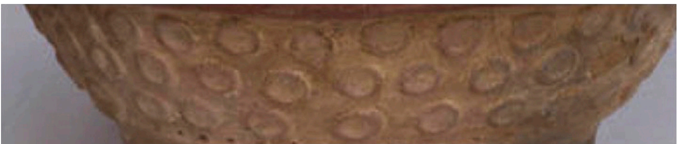
Figure 8: Potosí censer raised circular 'O' pellet detail.

shows a medium sized triangular cut-out, and Figure 15 shows a delicate cross or plus sign style of vent next to a small circular vent.