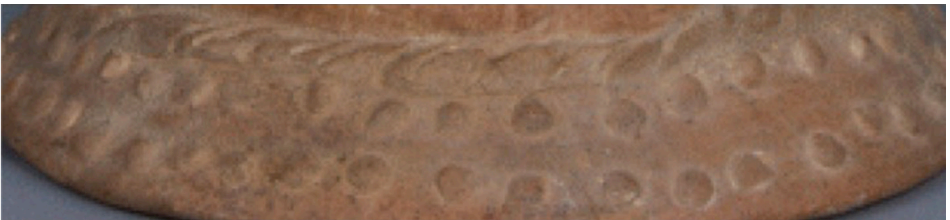
Figure 7: Potosí censer rounded 'lump' pellet detail.