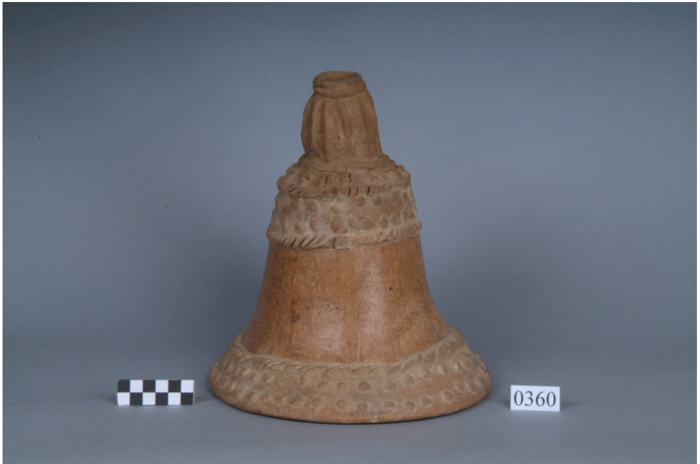
Figure 4: Potosí censer lid with seed-form applique pellets and fruit pod effigy, possibly representing cacao.

incense ‘act’ as the pollen. While we are unable to see pollen with the naked eye, more than 100,000 different species take part in pollination (Abrol, 2012), and local populations would have undoubtedly observed the local animals, birds, butterflies, bees, and/or insects taking part in the process. This reasoning may provide support for why the exterior surface lacks the applique pellets, as the exterior portion of a flower is general plain aside from the attachment of the sepal to the peduncle. Flowers also have some association to Tojolabal type spiked vessels manufactured in the Maya region, where people used a traditional spiked pedestal based vessel “as an offering receptacle for flowers” (Deal, 1982, p. 616). The Datura flower, for example, is represented on one version of Papagayo: Fonseca variety bowls (see Figure 12) manufactured in the Granada City area (see Dennett [2016]), and which have traditionally been thought of as a pinwheel, perhaps indicating these were similarly used as flower receptacles given the shallow depth of the Papagayo bowl.