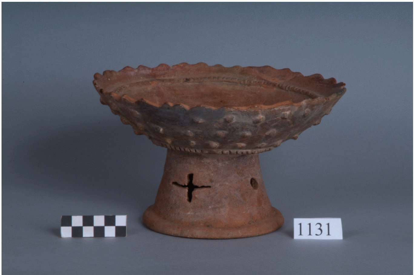
Figure 14: Smaller, more delicate cross-shaped ('+') venting style on Potosí censer base.

1980; Bransford, 1881; Haberland, 1992), in addition to the production of cacao, provides further support of cacao seed representation on the body. I believe that there was a greater knowledge base of plant biology than what we as archaeologists currently allow for. Seeds carry knowledge, food, and medicine among other things, and I believe that there was a greater respect and desire to preserve the sacred element of the biological world in which people lived. Bransford (1881) mentions the presence of seeds in addition to coffee and beans as burial offerings on Ometepe. Iconography displaying seeds on ceramic vessels could be the ultimate form of respect to that plant, reinforcement of its important place in the ritual economy of life, alongside the addition of those seeds in burial offerings to individuals, perhaps needed to start their new life in another world.