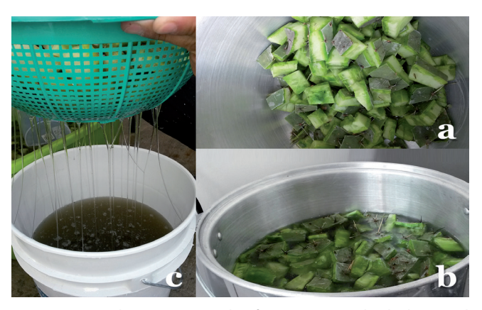
Figure 1 .- 1a, 1b, 1c: An example of extraction methods that need water to obtain the mucilage. 1a: Cladodes are chopped into small pieces, 1b: Cladodes are poured into water in a proportion of 1:2 (nopal : water in weight) for about 24 hours, 1c: Nopal mucilage is sieved through different sized meshes. Pérez et al., "The hydration of lime using nopal mucilage to optimize hydrated lime mortars for the conservation of built heritage". MNCARS, Madrid, Spain, in press.

The extraction methods tested were classified into two groups: the ones that need water to obtain the mucilage (constant ratio followed: 1:2, nopal: water by weight) [Figure 1a, b, c], and the ones that obtain the mucilage directly from the plant without any other substance [Figure 2a, b, c] [Table 1]. The resulting product from each method is considered as a 100% solution of mucilage.