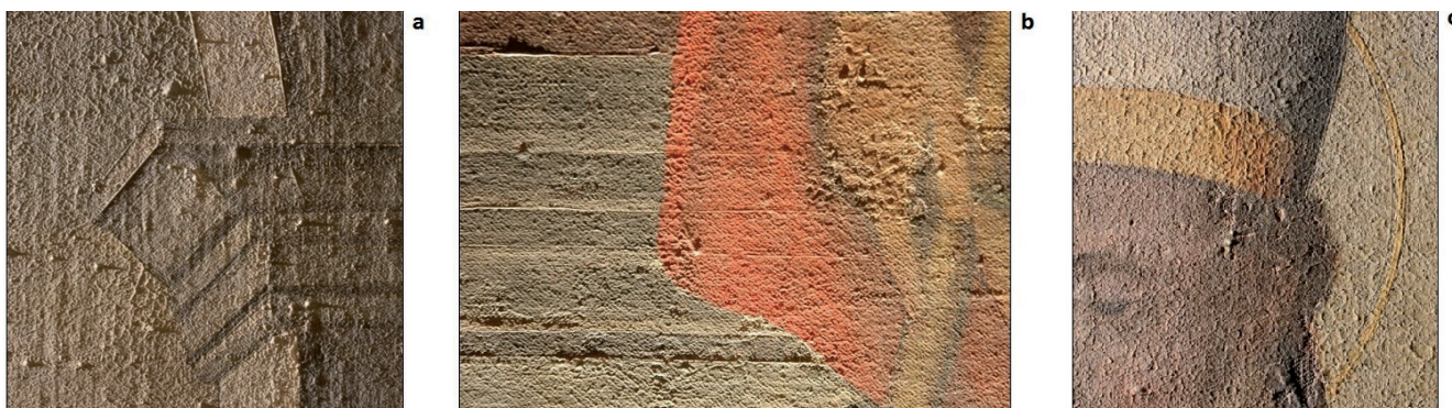
Figure 2.- Details in Raking Light: a) second capital from the right, b) steps of the throne with the mantle of St. Roch, c) face of St. Felix.

reveal the protein-based binders and the saponification reaction with ammonia and hydrogen peroxide to detect oils.