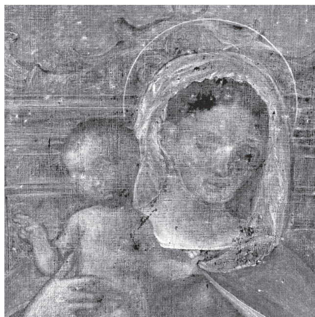
Figure 4.- RX of the Virgin Mary with the Child.

The last elements sketched are the halos. In fact, in the RX of the Virgin Mary in Figure 4, as well as in the RX of the Saints, the sign of the compass to depict the halo does not continue under the faces. From the RX is also possible to notice that the details of the faces are not so evident, while the weft of the canvas is the main present element. This is due to a very thin pictorial layer, which is appreciable in raking light photos (Fig. 2) and in the cross sections, too [Figure 5a].