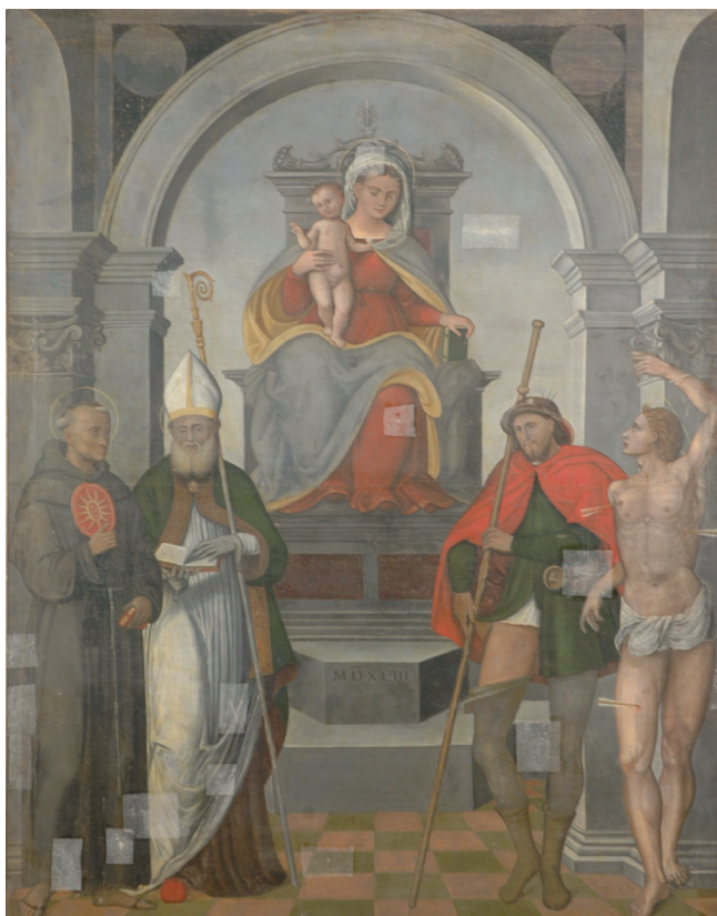
Figure 1. - The Trichiana Altarpiece.