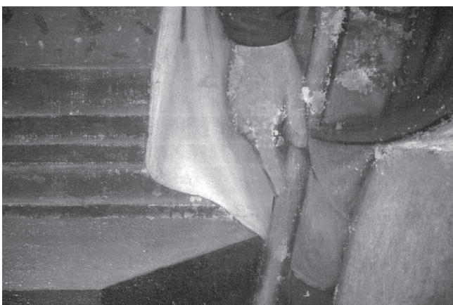
Figure 3.- Detail in IRR of the steps of the throne with the mantle of St. Roch.

In Figure 3, the IRR of the steps of the throne and the mantle of St. Roch is reported. The comparison with the image in Figure 2b shows that the steps of the throne continue under the red mantle, thus indicating that Giovanni firstly depicted the architectures, then the human figures.