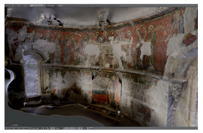
Figure 3. - Three-dimensional view of the mural paints of the Collegiate church of Daroca made by convergent photogrammetry.

death of General Franco" General Franco" (García Cuetos, 2013). The results of those researches have been collected in numerous publications, the most important of which are: Restaurando la Memoria, España e Italia ante la recuperación monumental de posguerra (García Cuetos, 2010) and Historia, restauración y reconstrucción monumental en la posguerra Española (García Cuetos, 2012). In addition to those books, numerous scientific articles and conference proceedings of congresses have been published, which are, however, directed to a specific public.