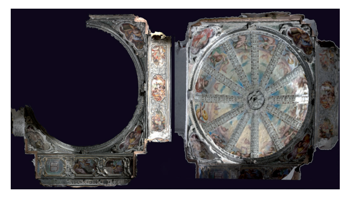
Figure 1 .- Orthophotograph made from the three-dimensional model of the dome of the Purification Chapel of the church of Santa Maria del Carmine in Milan, Italy.

We have a case where the three-dimensional restitution is made in draft form using the technique of convergent photogrammetry (restitution of geometry by performing conventional photographs that are interpreted by a computer programme which also generates a three-dimensional model texture—mapping—applied to it) García León (2008). The preference for using this technique rather than others, such as a laser scanner, is because we are obtaining a map of faithful colours applied to a three-dimensional model which is essential for our purposes and the cameras of the scanner do not allow us to obtain a final quality result. Conventional digital photography applied in this system allows us to perform white balance, and all necessary corrections before making photographs, thus giving us a high quality texture.