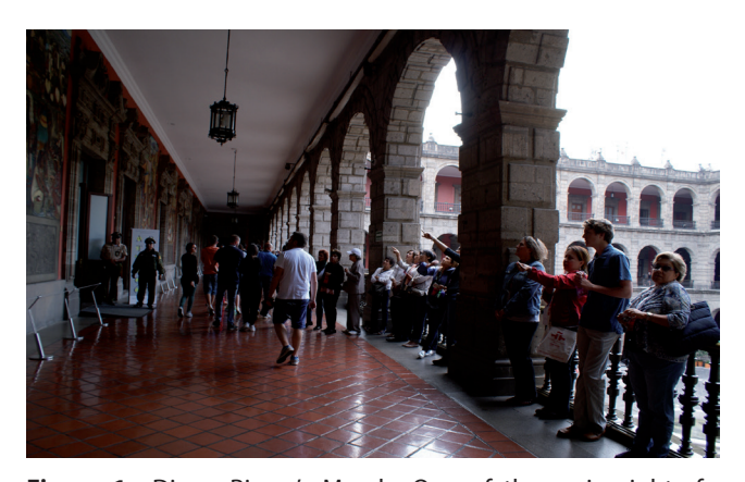
Figure 1. - Diego Rivera's Murals. One of the main sights for visitors at the inside of National Palace. DGCPN-SHCP. 2016.

The main goal of the National Palace Conservator Office is founded on the objectives established by a presidential decree issued in 2013, which is "to protect, conserve, restore and reuse immovable and movable cultural heritage contained in the building" (DOF, 2013). Thus, based on the provisions of the national regulatory framework and in consideration of international recommendations, the Conservator Office seek to ensure optimal operation and use of National Palace, in addition to strengthening the positioning of its museum spaces according to international standards.