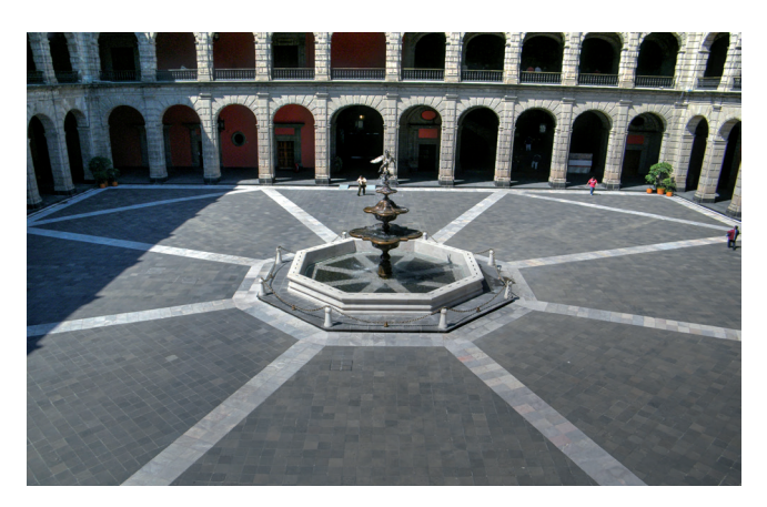
Figure 2. - Main courtyard on National Palace. The Pegasus fountain in the center. DGCPN-SHCP. 2015.

In order to accomplish this goal, the team that collaborates in the Conservator Office has the vision to position National Palace as a comprehensive model to conservation of cultural heritage and social convergence, through cultural areas of first level, allowing Mexicans and visitors to enrich their knowledge and appreciate the historical and symbolic values of the monument. This is in synchrony to the Mexico's Declaration on Principles Governing the Cultural Policy, which states "sustainable development can only be achieved through the integration of the cultural factors within the strategies proposed for this; thus, those strategies should always consider the historical, social and cultural aspects of each society" (UNESCO, 1982). Therefore, the objectives of the Master Plan for the Conservation of National Palace, which is the fundamental methodological strategy of the Conservator Office, is divided into five strategic axes defined by themes: