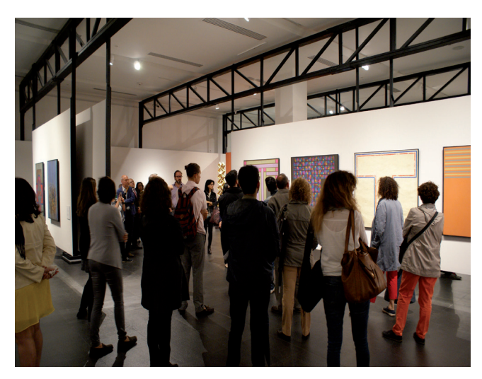
Figure 5. - Dissemination of cultural activities of the National Palace with visitors. DGCPN-SHCP. 2016.

In reference to the mentioned above, the National Development Plan states that it is necessary to "promote the care and conservation of cultural, historical and natural heritage of the country" in order to, according to the Norms of Quito, "turn tourism into a source of welfare (...), along with the necessity for the restoration and empowerment of cultural heritage to promote tourism, this meaning that investment of financial, human and material resources should be integrated into a regional economic development plan" (ICOMOS, 1967).