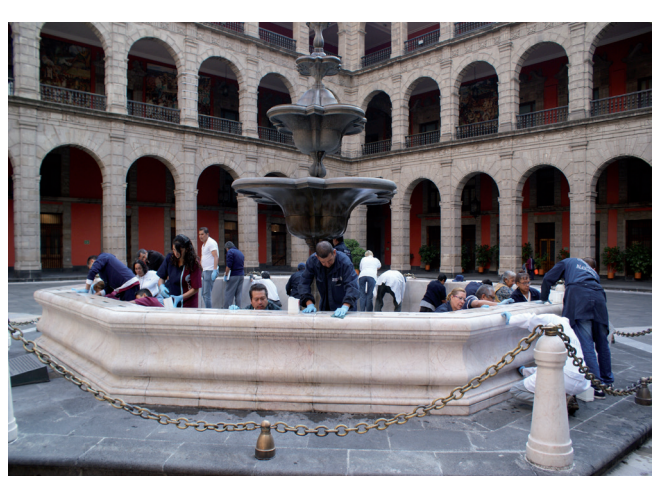
Figure 6. - On site practice of the preventive conservation course. 36 workers participate in the active conservation of the cultural heritage in National Palace. DGCPN-SHCP. July 2016.

In this way, the main challenge has been met, since the Conservator Office prepared and dictated the first