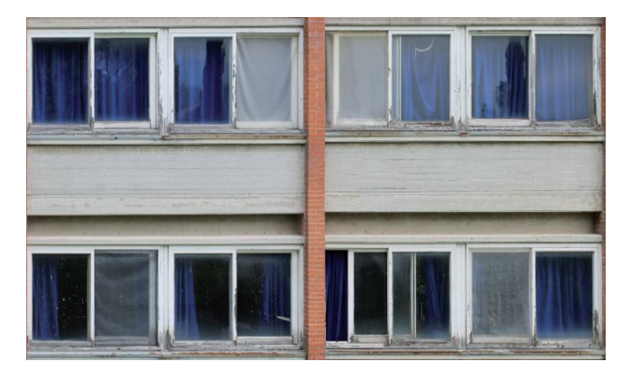
Figure 5.- Collegio del Tridente. The windows of the rooms.