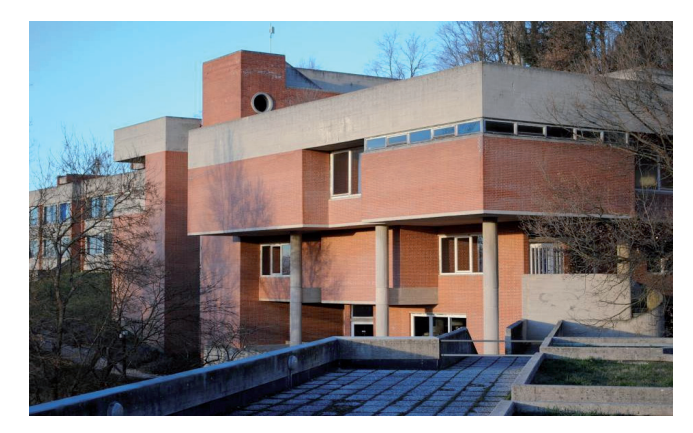
Figure 3.- Collegio dell'Aquilone. Façade.

In addition to the dimension of the elements (in some cases the thickness is less than 10 cm), that does not guarantee an adequate level of protection from the corrosion of the reinforcement, there are specific risk factors to be considered such as the different types of mix design, the environmental conditions (position, exposure, orientation), the quality of materials and construction; the surface treatments (some surfaces have been bush-hammered and this resulted in an increased porosity and, consequently, an increased vulnerability). Consequently, there are different levels of decay, ranging from a good state of repair to situations in which the corrosion of the reinforcement bars has already led to cracking,