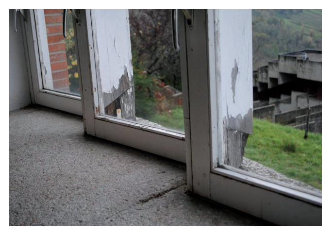
Figure 4.- Collegio del Colle. Decay of the window frames.