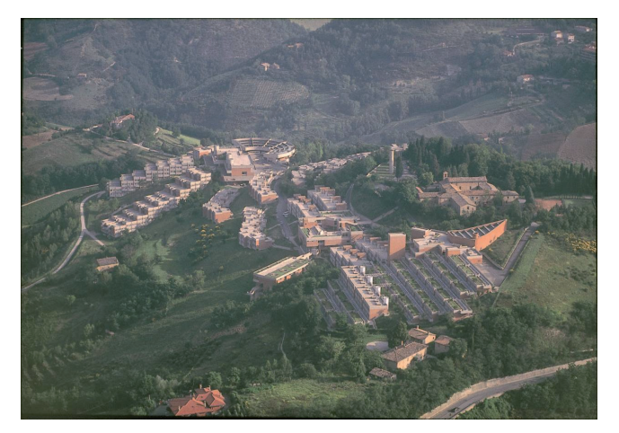
Figure 1.- Aereal view. (Ph. Fulvio Palma).

The concept behind the project was incredibly modern: a university campus open to the city, provided with services and cultural activities, which citizens could access.