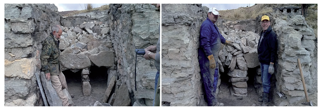
Figure 4.- Old masons placing gypsum stones in the oven, Navarrete.

In placing gypsum stones, the experience of the old masons was extremely important: The stones with larger size and density were placed at the bottom part of the oven to withstand the weight of the other pieces as well as the most intense fire. These stones were placed in the lowest and central portions of the oven, as well as in the areas around the fire [figure 4]