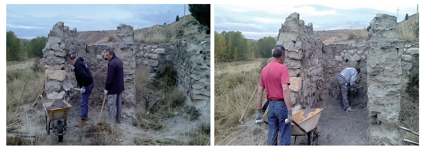
Figure 3.- Remains of a former oven in Navarrete.

For our purposes, and to ensure the correct size and temperature distribution during the calcination process, we restored to the correct proportions the remains of a former oven made of gypsum stones and located in a gypsum quarry [figure 3].