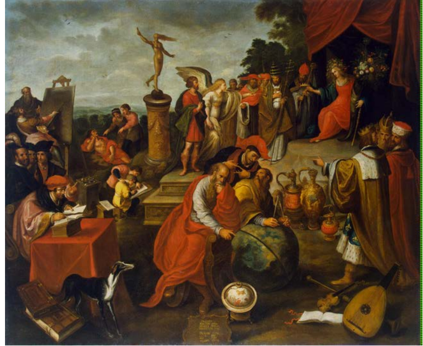
Fig. 7. Frans Francken II, Occasio – Allegory of Good Fortune (1627), Zamek Królewski na Wawelu [Wawel Castle Museum], Cracow