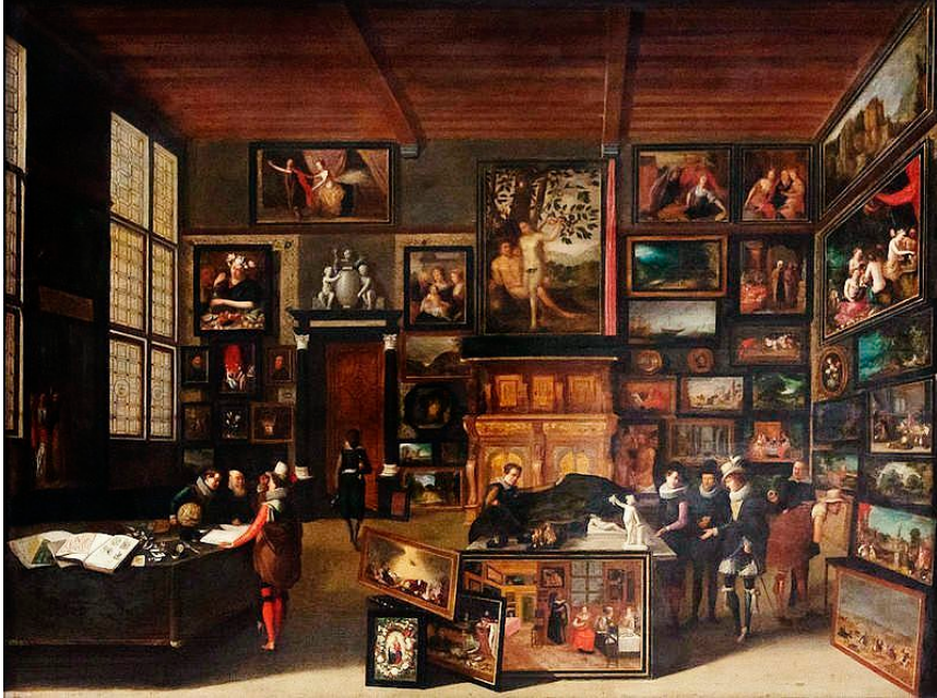
Fig. 4. Hieronymus Francken II (attrib.), Jan Snellink's Art Gallery or Cabinet of an Art Collector (1621), Musées royaux des Beaux-Arts, Brussels.