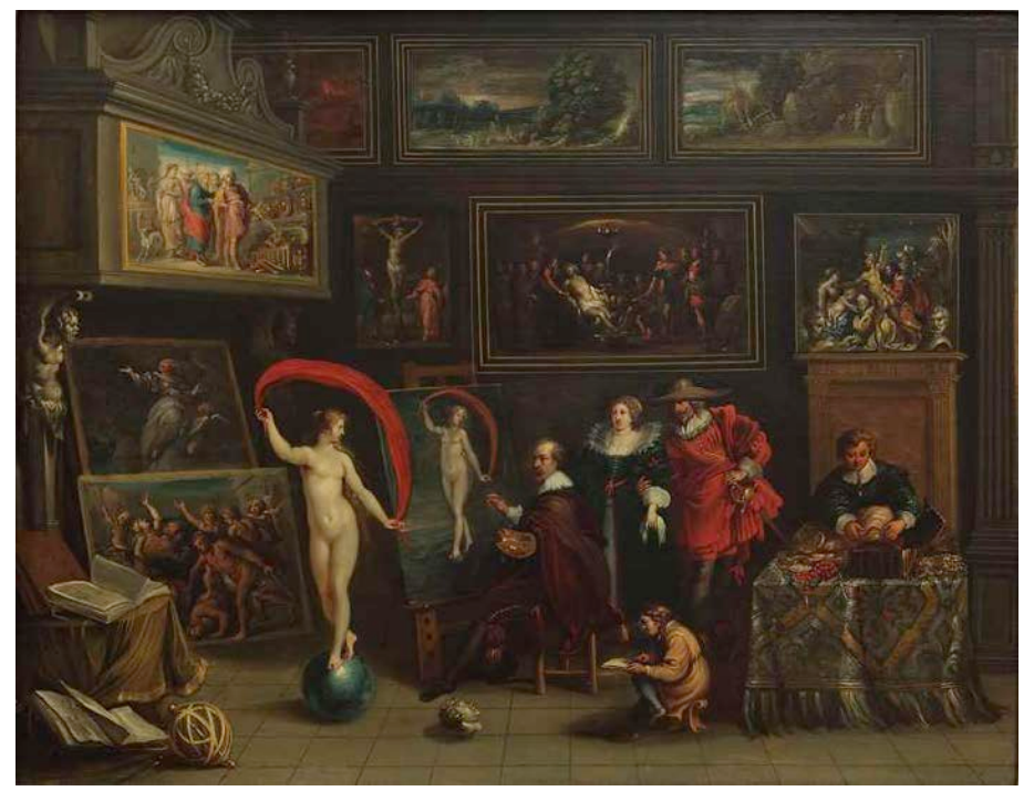
Fig. 1. Frans Francken II, The Painter's Cabinet (1623), Private collection, Las Arenas, Getxo, Bilbao