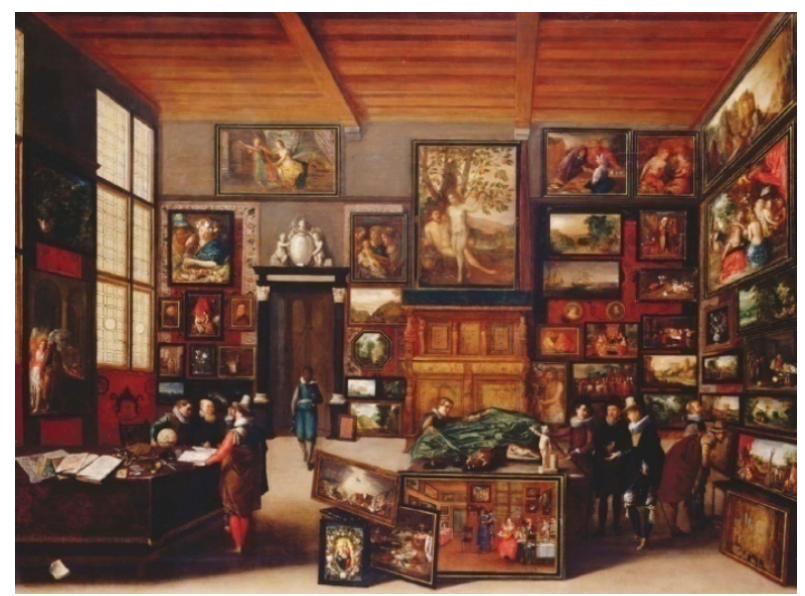
Fig. 5. Hieronymus Francken II (attrib.), Cognoscenti in a Room Hung with Pictures (c. 1620), Private collection (ex-Christie's, 7 July 1955).