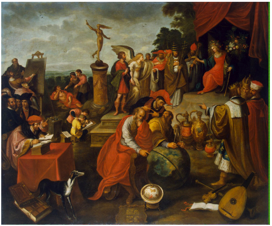
Fig. 11. Frans Francken II, Allegory of Chance (1627), Gosudárstvennyj Ermitáž [State Hermitage Museum], Saint Petersburg

There is the same inscription on the face of the square pedestal of the statue of Opportunity in the Périgord museum painting, but, according to de Mirimonde, it has been altered by excessively heavy cleanings and repaints. He reproduces it in footnote 16 indicating the corrections he deemed necessary. In his second article, he transcribes correctly the "Catonian" distich, but again without indication of its origin.