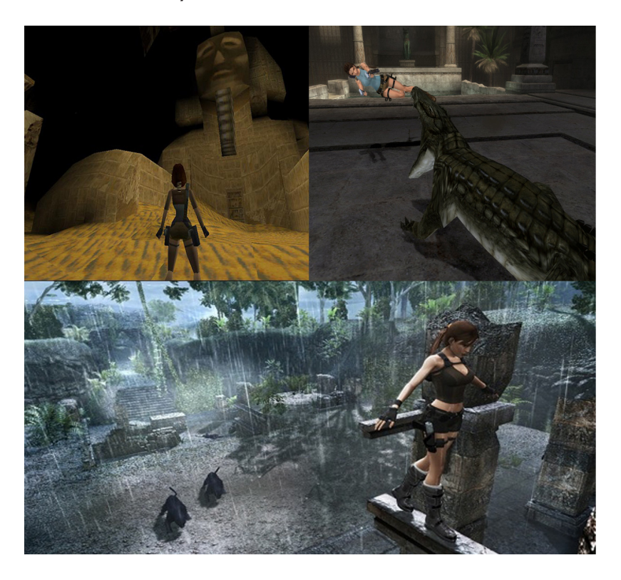
Figure 2. Lara Croft exercising her archaeological profession: in front of the sphinx of Gizeh, confronting a giant crocodile and in a temple of Southeast Asia. Notice the obvious graphic evolution from 1996 (top left) to 2008 (below).

Company. The title of the video game already discloses the image of Archaeology that we find in it, starring Lara Croft, a character introduced to us as an English archaeologist. In every title of the Tomb Raider saga we have to control this female alter ego of Indiana Jones, who is fully armed with guns and weapons, to find various treasures and objects related with real ancient cultures and/or civilizations, such as the Inca Empire, the Classical Antiquity triumvirate (ancient Egypt, Greece and Rome), ancient China, ancient India or ancient Cambodia, or fictional cultures such as Atlantis, confronting villains, colossal animals, armed enemies or supernatural forces (figure 2). We never see her digging up an archaeological site from dawn to dusk, measuring an archaeological trial pit or analysing the artefacts that she finds, being far from spreading the results of her "research"; but we can jump and shoot to face the dark secrets that the mysterious artefacts hide!