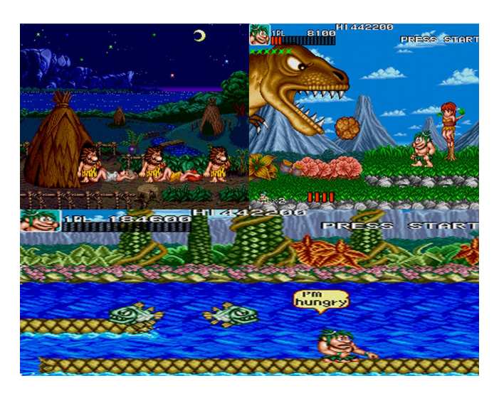
Figure 3. Some screenshots from Joe and Mac: Caveman Ninja: the kidnapping of the women of the group by hairy and rough hominids (top left); Joe saving a woman from the jaws of a Tyrannosaurus rex (top right); Joe expiring because he has not fed himself (below).

The image of Prehistory that we find in video games is not very different, in its absence of rigor, to that seen of Archaeology. In this regard, those video games set in the Prehistoric Age commit the classical mistake, in the style of films like One Million Years B. C. , of placing our ancestors in a world full of dinosaurs. We can observe this unscientific aspect in Chuck Rock and his sequels, a work from Core Design launched in 1991 to home video consoles, and in the arcade machine Prehistoric Isle in 1930 .