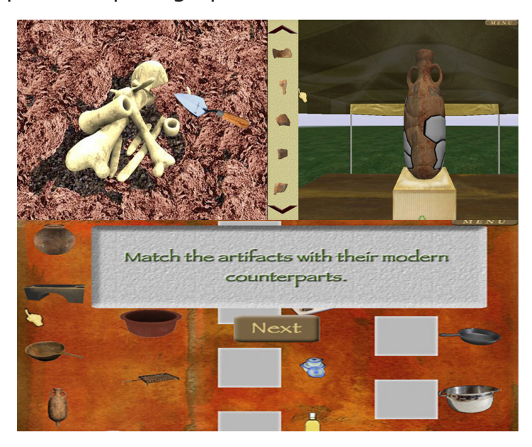
Figure 4. Some of the activities that we can execute in Roman Town: digging up bones with our trowel (top left); reconstructing a vessel (top right); comparing ancient and modern objects (below) (http://dig-itgames.com/index.php/archaeology-computer-gameroman-town/).

video game has a bad or very simple gameplay it becomes a mediocre work, although the video game is superb in audiovisual terms. Roman Town , besides from having a very easy gameplay , without true levels of difficulty, presents poor graphic and audio features.